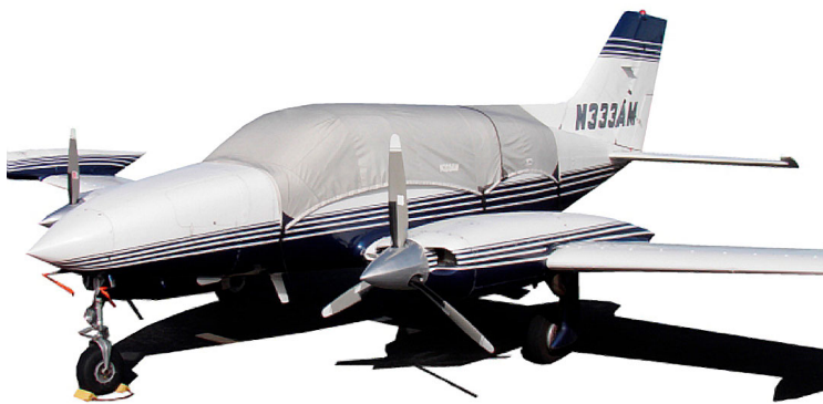
Cessna 414 Canopy Cover & Pitot Covers

Travel Covers are made with Silver Solution-Dyed Polyester fabric and only lined over the windshield to save weight. The material is lightweight and more compact for easy stowage in the aircraft. The polyester material is water resistant, but only intended for occasional use outside. We also have an ultra lightweight material available for fitted hangar dust covers. For daily outdoor use, the non-travel Sunbrella Cover is the best choice.