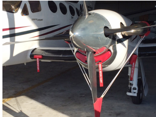
Cessna Conquest I Prop Tie/Exhaust Covers, Engine Plugs