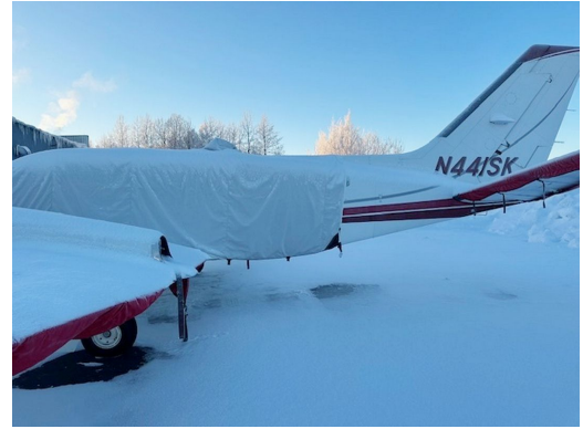
Cessna 441 Extended Canopy/Nose Cover