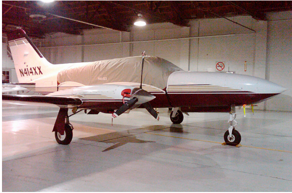
Cessna 414 Canopy Cover and Engine Inlet Plugs

Covers developed this material combination especially for aircraft protection. The outer material is medium weight and treated for water resistance, UV resistance and anti-static buildup. The inner lining is a very soft and smooth microfiber to prevent scratching. The material is very reflective, and tests show that the cabin interior temperature can be reduced to near-ambient temperature on the hottest of days. It is water, ice and snow repellent, yet breathable to allow moisture to escape from between the cover and the aircraft surface.