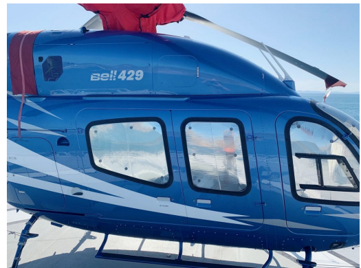
Bell 429 Cockpit & Cabin HeatShields