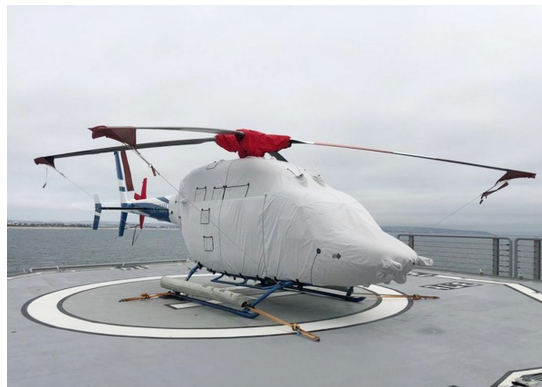
Bell 429 Main Body Cover, Rotor Hub & Tail Rotor Covers