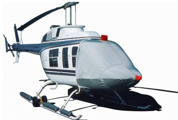
Cockpit Cover on Bell 206L