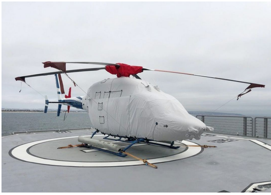
Bell 429 Main Body Cover, Rotor Hub & Tail Rotor Covers