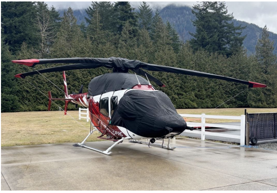
Bell 429 Cold Weather Cover Set