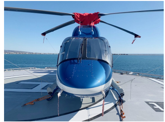
Bell 429 Windshield HeatShields, Rotor Mast Cover