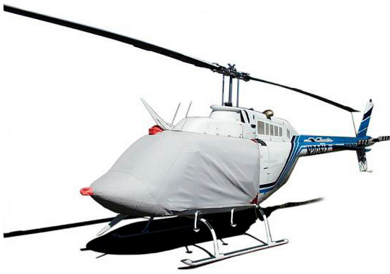
Bell 206B Bubble Cover