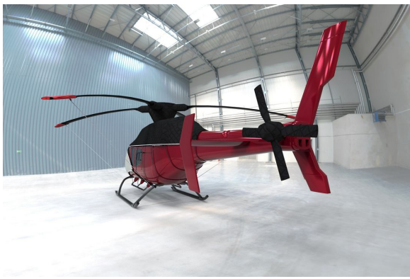
Bell 429 Tail Rotor, Engine, Rotor Hub Covers