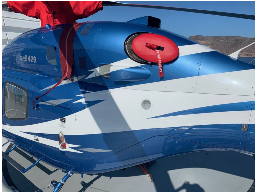
Bell 429 Exhaust Plug

The Engine Exhaust Plugs are custom fit for your Bell 429 exhaust openings, made with heavy-duty vinyl material, and stuffed with a single block of sculpted urethane foam. Exhaust plugs have 'Remove Before Flight' streamers sewn onto the face of the plugs. Exhaust plugs may be inserted soon after flight when the engine is still warm. Engine Inlet Plugs are commonly referred to as Cowl Plugs, Intake Plugs, Cowl Blocks, Engine Blocks, and Engine Bungs.