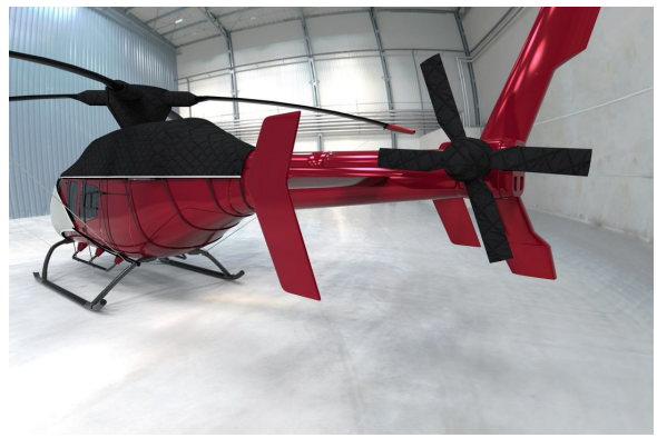
Bell 429 Tail Rotor, Engine, Rotor Hub Covers