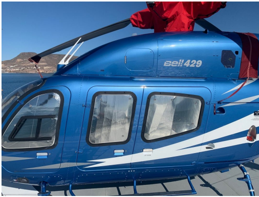
Bell 429 Cockpit & Cabin HeatShields, Rotor Mast/Drive Shafts Cover

Cockpit Heatshields are interior sunshades for the aircraft's cockpit. The product is a unique composite of closed-cell foam with a silver mylar finish. The semi-rigid design is stiff enough to stand inside the window framing. Darts and folds are incorporated into the material so that it conforms to the complex shape of the helicopter windows. The set folds up flat and is easily stored in the included storage sleeve. Some designs may require velcro and suction cups. A Heatshield is an excellent short-term remedy for cockpit overheating, but an external fabric cover is more effective for long-term protection.