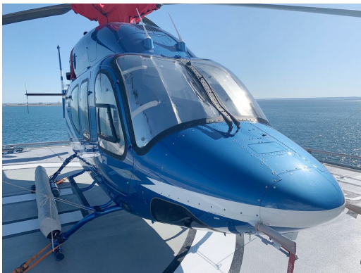
Bell 429 Cockpit HeatShields

Cockpit Heatshields are interior sunshades for the aircraft's cockpit. The product is a unique composite of closed-cell foam with a silver mylar finish. The semi-rigid design is stiff enough to stand inside the window framing. Darts and folds are incorporated into the material so that it conforms to the complex shape of the helicopter windows. The set folds up flat and is easily stored in the included storage sleeve. Some designs may require velcro and suction cups. A Heatshield is an excellent short-term remedy for cockpit overheating, but an external fabric cover is more effective for long-term protection.