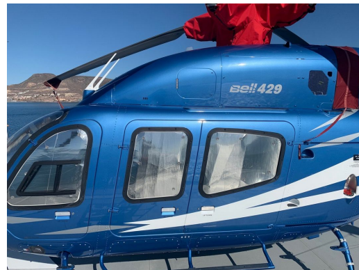
Bell 429 Cockpit & Cabin HeatShields, Rotor Mast/Drive Shafts Cover