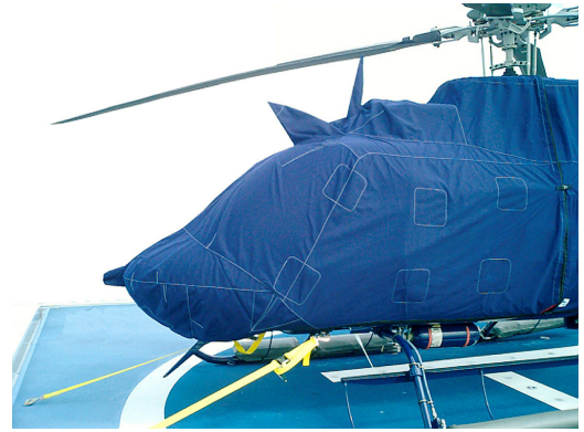
206B/206L/407 Full Body Cover