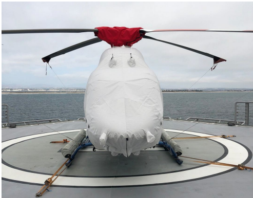
Bell 429 Main Body Cover, Rotor Hub & Tail Rotor Covers

WINTER USE MATERIAL - Made with Solution-Dyed Polyester fabric, this option is intended for seasonal use to aid in deicing, rain mitigation, or for occasional travel. The material is lighter and more compact, but more susceptible to UV damage and may have a shorter useful life if used continuously outside than the all-year use material.