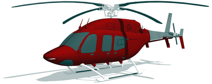
Bell 429 Insulated Tailboom Cover