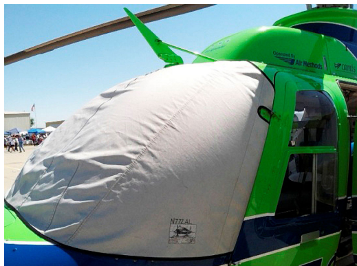
Bell 407 Windshield Cover

Travel Covers are made with Silver Solution-Dyed Polyester fabric and fully lined over the entire cover. The material is lightweight and more compact for easy stowage in the aircraft. The polyester material is water resistant, but only intended for occasional use outside. We also have an ultra lightweight material available for fitted hangar dust covers. For daily outdoor use, the non-travel Sunbrella Cover is the best choice.