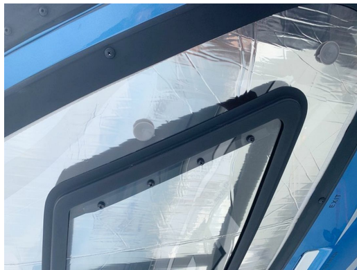
Bell 429 Cockpit & Cabin HeatShields

Cockpit Heatshields are interior sunshades for the aircraft's cockpit. The product is a unique composite of closed-cell foam with a silver mylar finish. The semi-rigid design is stiff enough to stand inside the window framing. Darts and folds are incorporated into the material so that it conforms to the complex shape of the helicopter windows. The set folds up flat and is easily stored in the included storage sleeve. Some designs may require velcro and suction cups. A Heatshield is an excellent short-term remedy for cockpit overheating, but an external fabric cover is more effective for long-term protection.