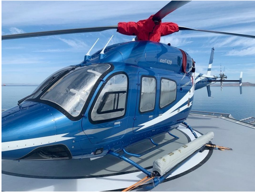
Bell 429 Rotor Hub Cover, Cockpit & Cabin HeatShields

WINTER USE MATERIAL - Made with Solution-Dyed Polyester fabric, this option is intended for seasonal use to aid in deicing, rain mitigation, or for occasional travel. The material is lighter and more compact, but more susceptible to UV damage and may have a shorter useful life if used continuously outside than the all-year use material.