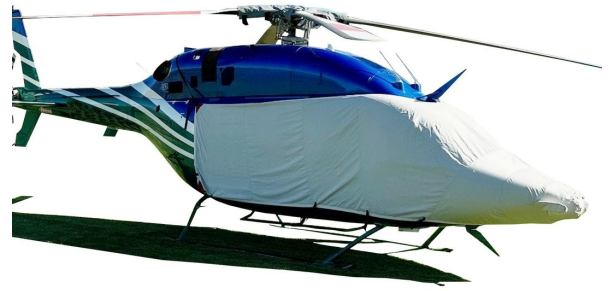
Bell 429 Bubble Cover