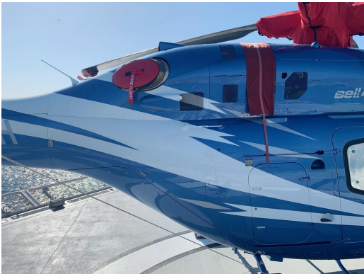
Bell 429 Exhaust Plug, Rotor Mast Cover