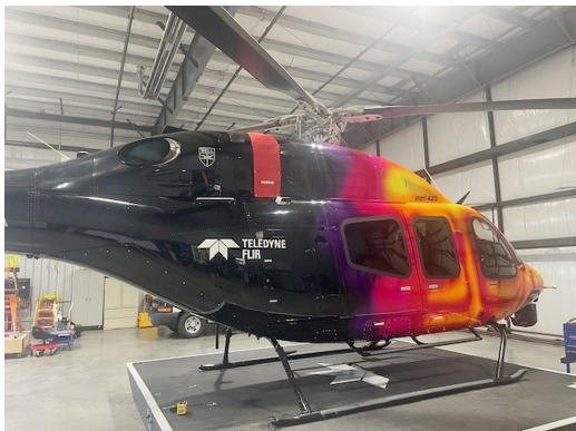
Bell 429 Inlet Barrier Filter Cover, Snap-On

WINTER USE MATERIAL - Made with Solution-Dyed Polyester fabric, this option is intended for seasonal use to aid in deicing, rain mitigation, or for occasional travel. The material is lighter and more compact, but more susceptible to UV damage and may have a shorter useful life if used continuously outside than the all-year use material.