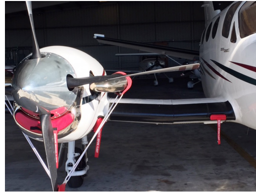
Cessna Conquest I Prop Tie/Exhaust Covers, Engine Plugs