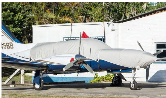
Cessna 421 Canopy Cover & Nose Cover

Travel Covers are made with Silver Solution-Dyed Polyester fabric and only lined over the windshield to save weight. The material is lightweight and more compact for easy stowage in the aircraft. The polyester material is water resistant, but only intended for occasional use outside. We also have an ultra lightweight material available for fitted hangar dust covers. For daily outdoor use, the non-travel Sunbrella Cover is the best choice.