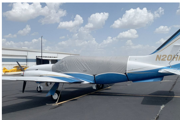
Cessna 414 Travel Weight Canopy Cover