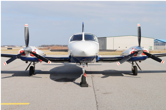
Cessna 421C Engine Inlet Plugs

Engine Inlet Plugs are custom fit for your Cessna 414, 414A intakes, made with heavy-duty vinyl material, and stuffed with a single block of sculpted urethane foam. Each plug has a zipper that allows the foam to be removed and dried if necessary. Engine plugs have warning flags that are visible from the cockpit or 'remove before flight' streamers sewn onto the face of the plugs. Most plugs are imprinted with the aircraft registration number in black for an extra charge. Storage bag NOT included. Engine plugs may be inserted after flight when the engine is still warm. Engine Inlet Plugs are commonly referred to as Cowl Plugs, Intake Plugs, Cowl Blocks, Engine Blocks, and Engine Bungs.