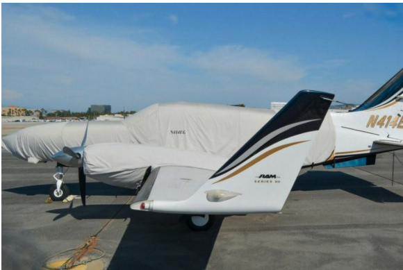
Cessna 414 Extended Canopy/Nose Cover, Engine Covers