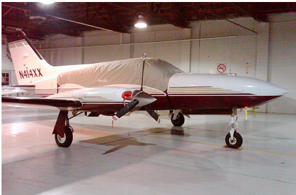
Cessna 414 Canopy Cover and Engine Inlet Plugs

This cover type is made from Silver Acrylic Sunbrella canvas and is 100% lined with a soft and smooth microfiber. Bruce's Custom Covers developed this material combination especially for aircraft protection. The outer material is medium weight and treated for water resistance, UV resistance and anti-static buildup. The inner lining is a very soft and smooth microfiber to prevent scratching. The material is very reflective, and tests show that the cabin interior temperature can be reduced to near-ambient temperature on the hottest of days. It is water, ice and snow repellent, yet breathable to allow moisture to escape from between the cover and the aircraft surface.