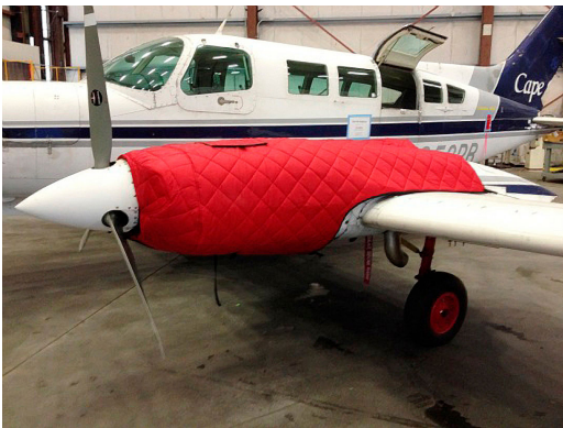
Cessna 402 Insulated Engine Cover

This cover type is made from Silver Acrylic Sunbrella canvas and is 100% lined with a soft and smooth microfiber. Bruce's Custom Covers developed this material combination especially for aircraft protection. The outer material is medium weight and treated for water resistance, UV resistance and anti-static buildup. The inner lining is a very soft and smooth microfiber to prevent scratching. The material is very reflective, and tests show that the cabin interior temperature can be reduced to near-ambient temperature on the hottest of days. It is water, ice and snow repellent, yet breathable to allow moisture to escape from between the cover and the aircraft surface.