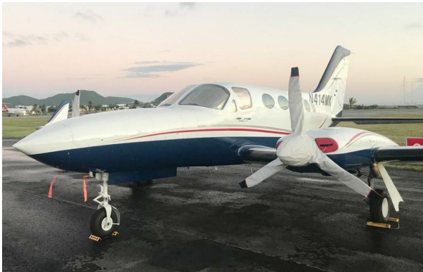
Cessna 414 Propellor/Spinner Covers, 3 Blade

This cover type is made from Silver Acrylic Sunbrella canvas and is 100% lined with a soft and smooth microfiber. Bruce's Custom Covers developed this material combination especially for aircraft protection. The outer material is medium weight and treated for water resistance, UV resistance and anti-static buildup. The inner lining is a very soft and smooth microfiber to prevent scratching. The material is very reflective, and tests show that the cabin interior temperature can be reduced to near-ambient temperature on the hottest of days. It is water, ice and snow repellent, yet breathable to allow moisture to escape from between the cover and the aircraft surface.