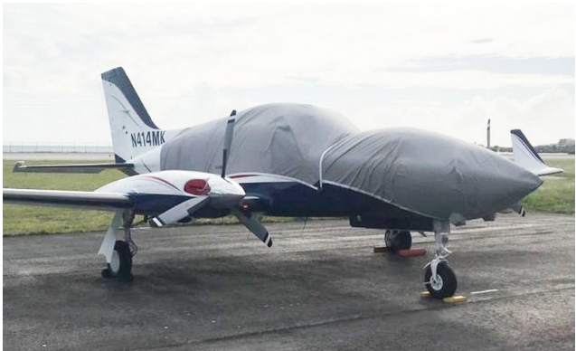
Cessna 414 Travel Cover, Light Weight Canopy Cover