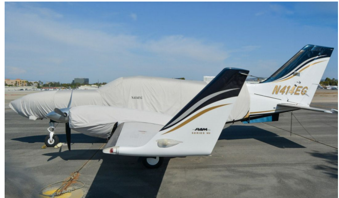
Cessna 414A Extended Canopy/Nose Cover & Engine Covers