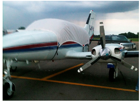
Cessna 401B Canopy Cover