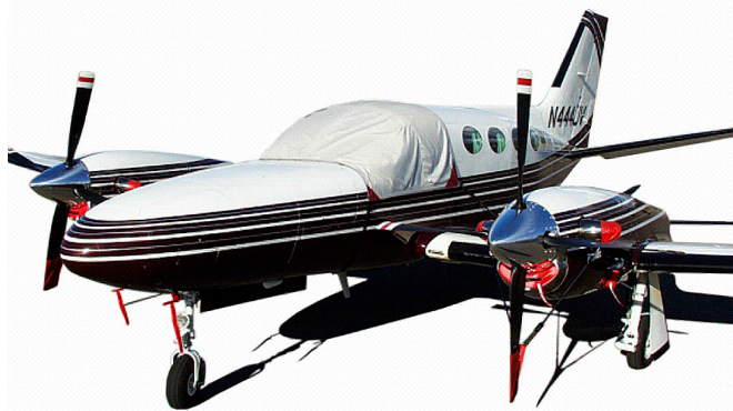
Cessna 425 Cockpit Cover

This cover type is made from Silver Acrylic Sunbrella canvas and is 100% lined with a soft and smooth microfiber. Bruce's Custom Covers developed this material combination especially for aircraft protection. The outer material is medium weight and treated for water resistance, UV resistance and anti-static buildup. The inner lining is a very soft and smooth microfiber to prevent scratching. The material is very reflective, and tests show that the cabin interior temperature can be reduced to near-ambient temperature on the hottest of days. It is water, ice and snow repellent, yet breathable to allow moisture to escape from between the cover and the aircraft surface.