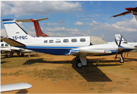
Cessna 441 Conquest II Cockpit Cover