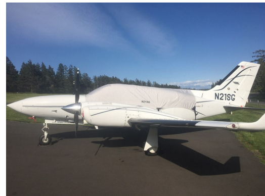
Cessna 421C Canopy Cover