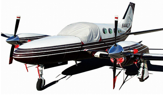
Cessna 425 Cockpit Cover