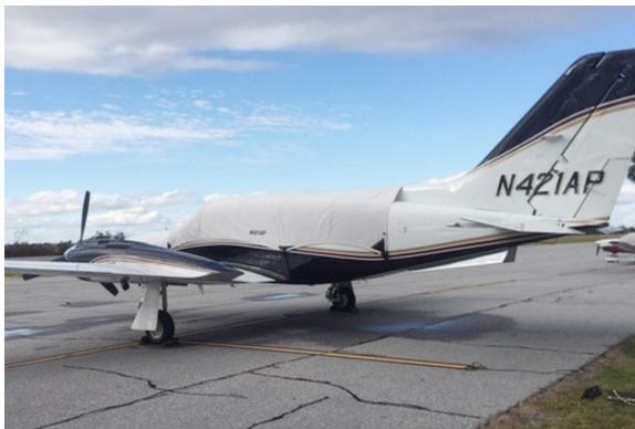
Cessna 421 Canopy Cover

The Cessna 402 Nose Cover is designed to cover the section of the fuselage forward of the windshield to the tip of the nose. It is secured with belly straps. This cover type is made from Silver Acrylic Sunbrella canvas and is 100% lined with a soft and smooth microfiber. Bruce's Custom Covers developed this material combination especially for aircraft protection. The outer material is medium weight and treated for water resistance, UV resistance and anti-static buildup. The inner lining is a very soft and smooth microfiber to prevent scratching. The material is very reflective, and tests show that the cabin interior temperature can be reduced to near-ambient temperature on the hottest of days. It is water, ice and snow repellent, yet breathable to allow moisture to escape from between the cover and the aircraft surface.