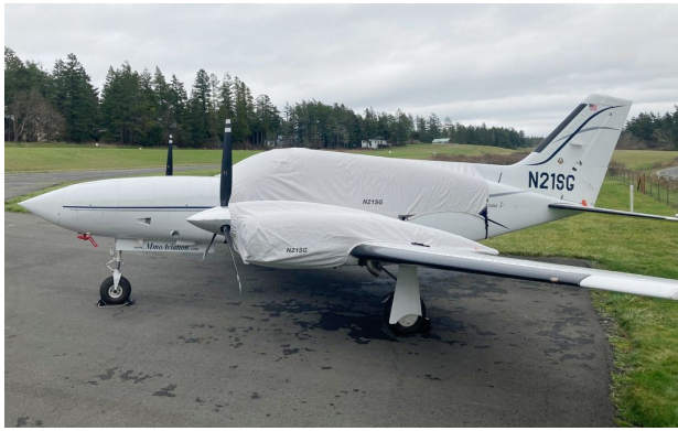
Cessna 421C Canopy & Engine Covers