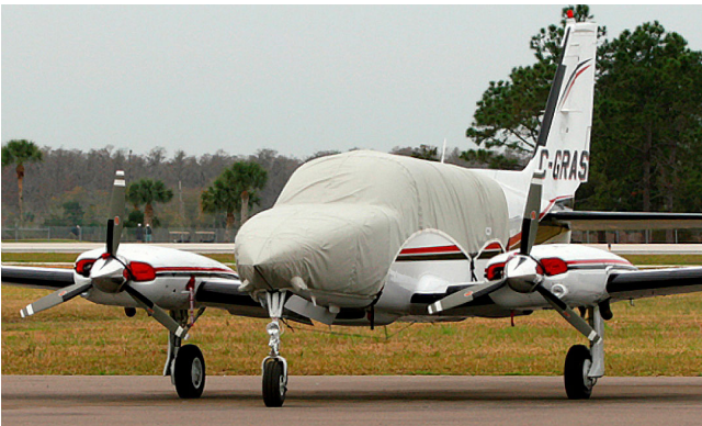
Cessna 340 Canopy/Nose Cover & Engine Inlet Plugs