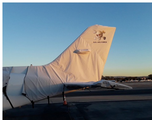
Cessna 421 Empennage Cover