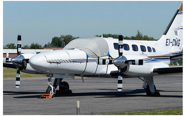
Cessna 441 Cockpit Cover