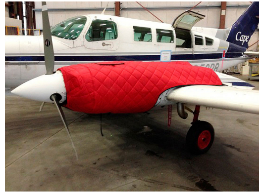
Cessna 402 Insulated Engine Cover