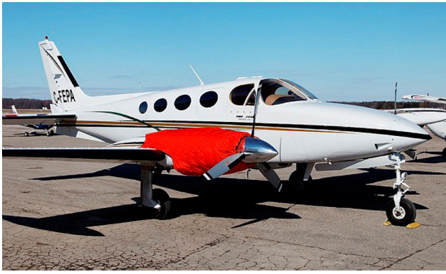
Cessna 340 Insulated Engine Covers