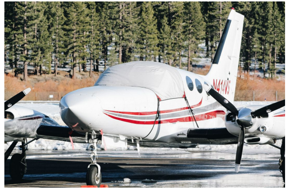
Cessna 414 Cockpit Cover