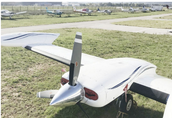
Cessna 340 Engine Inlet Plugs

Engine Inlet Plugs are custom fit for your Cessna 401 intakes, made with heavy-duty vinyl material, and stuffed with a single block of sculpted urethane foam. Each plug has a zipper that allows the foam to be removed and dried if necessary. Engine plugs have warning flags that are visible from the cockpit or 'remove before flight' streamers sewn onto the face of the plugs. Most plugs are imprinted with the aircraft registration number in black for an extra charge. Engine plugs may be inserted after flight when the engine is still warm. Engine Inlet Plugs are commonly referred to as Cowl Plugs, Intake Plugs, Cowl Blocks, Engine Blocks, and Engine Bunges.