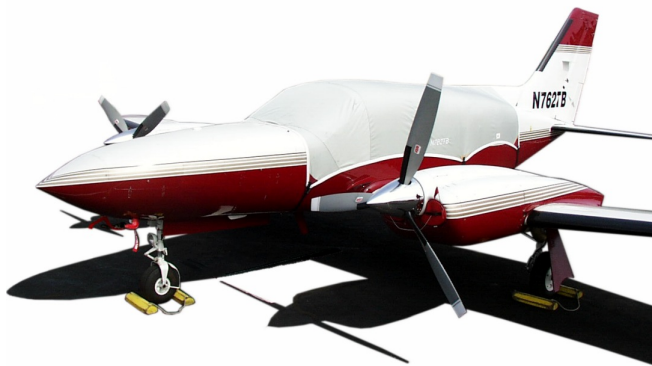
Cessna 421C Canopy Cover & Engine Plugs

Travel Covers are made with Silver Solution-Dyed Polyester fabric and only lined over the windshield to save weight. The material is lightweight and more compact for easy stowage in the aircraft. The polyester material is water resistant, but only intended for occasional use outside. We also have an ultra lightweight material available for fitted hangar dust covers. For daily outdoor use, the non-travel Sunbrella Cover is the best choice.