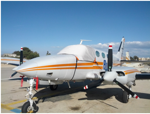
Cessna 340 Cockpit/Windshield Cover