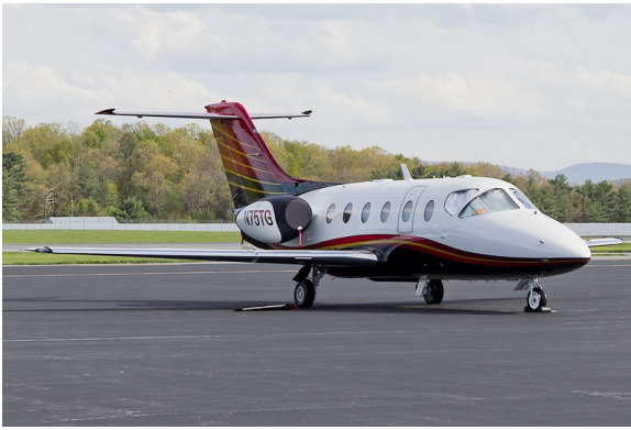
Nextant 400XTi Cockpit HeatShields, Bikini Type Engine Covers