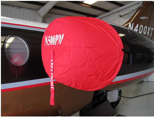
Nextant 400XTi Engine Covers