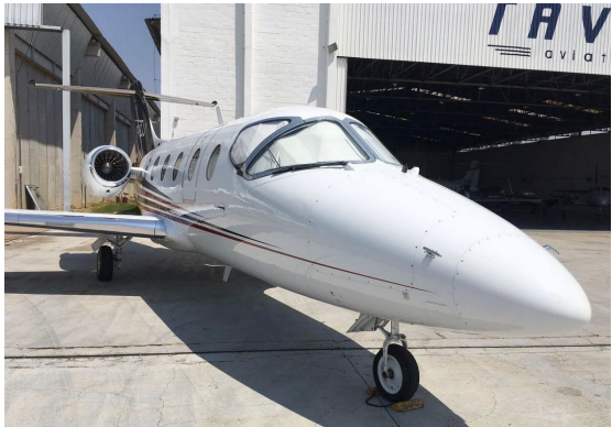
Beechjet Cockpit Heatshields