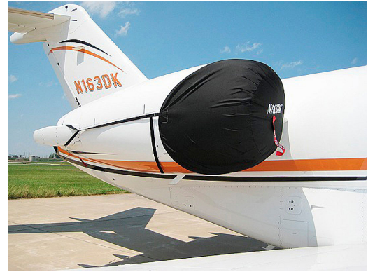
Hawker 4000 Intake Cover