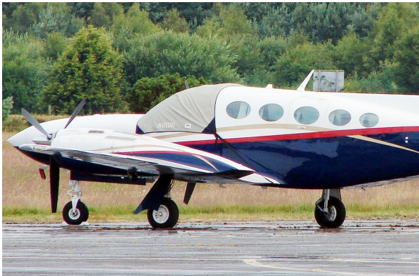
Cessna 421 Cockpit Cover