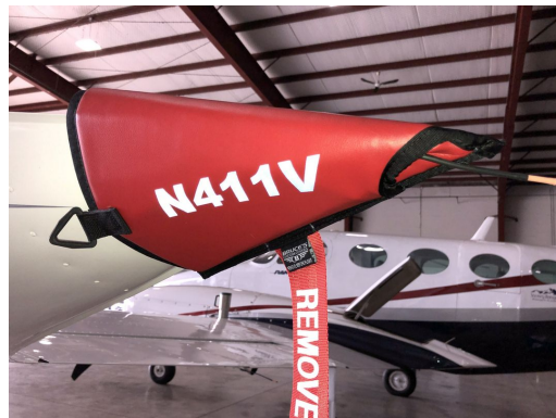
Cessna 335, 340 Wingtip Pads

Designed to prevent damage to the aircraft extremities in crowded hangars, these products are made of bright red Naugahyde and thickly padded with a sandwich of closed cell foam.