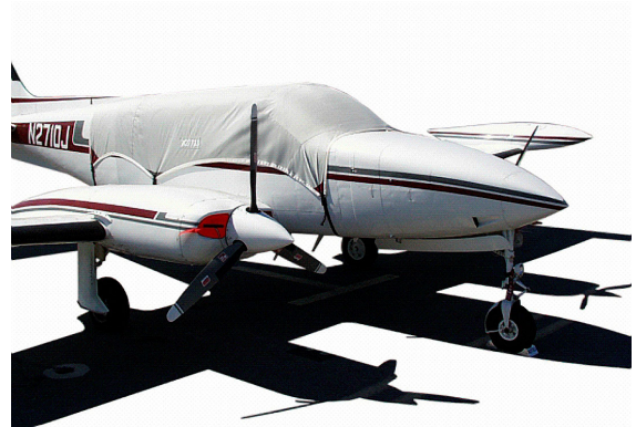
Cessna 340 Standard Canopy Cover