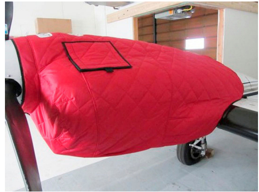
Cessna 421 Insulated Engine Covers