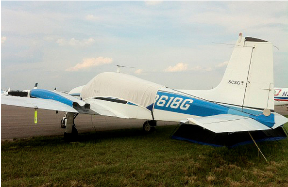
Cessna 320 Canopy Cover

Travel Covers are made with Silver Solution-Dyed Polyester fabric and only lined over the windshield to save weight. The material is lightweight and more compact for easy stowage in the aircraft. The polyester material is water resistant, but only intended for occasional use outside. We also have an ultra lightweight material available for fitted hangar dust covers. For daily outdoor use, the non-travel Sunbrella Cover is the best choice.