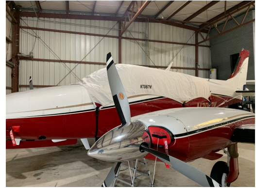
Cessna 340A Canopy Cover