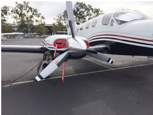
Cessna 414 Engine Inlet Plugs

Engine Inlet Plugs are custom fit for your Cessna 335, 340 intakes, made with heavy-duty vinyl material, and stuffed with a single block of sculpted urethane foam. Each plug has a zipper that allows the foam to be removed and dried if necessary. Engine plugs have warning flags that are visible from the cockpit or 'remove before flight' streamers sewn onto the face of the plugs. Most plugs are imprinted with the aircraft registration number in black for an extra charge. Storage bag NOT included. Engine plugs may be inserted after flight when the engine is still warm. Engine Inlet Plugs are commonly referred to as Cowl Plugs, Intake Plugs, Cowl Blocks, Engine Blocks, and Engine Bungs.