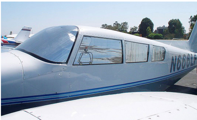
Piper PA-30 Twin Comanche Cockpit HeatShields

Cockpit Heatshields are interior sunshades for the aircraft's cockpit. The product is a unique composite of closed-cell foam with a silver mylar finish. The semi-rigid design is stiff enough to stand inside the window framing. The set folds up flat and is easily stored in the included storage sleeve. Some designs may require velcro and suction cups. A Heatshield is an excellent short-term remedy for cockpit overheating, but an external fabric cover is more effective for long-term protection.