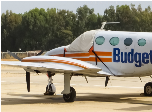
Cessna 340 Cockpit/Windshield Cover

This cover type is made from Silver Acrylic Sunbrella canvas and is 100% lined with a soft and smooth microfiber. Bruce's Custom Covers developed this material combination especially for aircraft protection. The outer material is medium weight and treated for water resistance, UV resistance and anti-static buildup. The inner lining is a very soft and smooth microfiber to prevent scratching. The material is very reflective, and tests show that the cabin interior temperature can be reduced to near-ambient temperature on the hottest of days. It is water, ice and snow repellent, yet breathable to allow moisture to escape from between the cover and the aircraft surface.