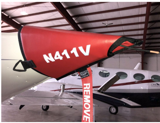
Cessna 335, 340 Wingtip Pads