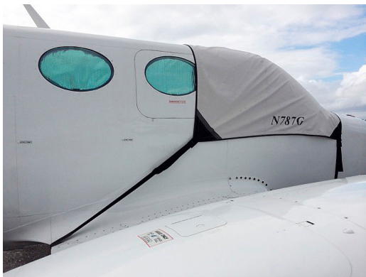
Cessna 340 Cockpit/Windshield Cover

Travel Covers are made with Silver Solution-Dyed Polyester fabric and only lined over the windshield to save weight. The material is lightweight and more compact for easy stowage in the aircraft. The polyester material is water resistant, but only intended for occasional use outside. We also have an ultra lightweight material available for fitted hangar dust covers. For daily outdoor use, the non-travel Sunbrella Cover is the best choice.