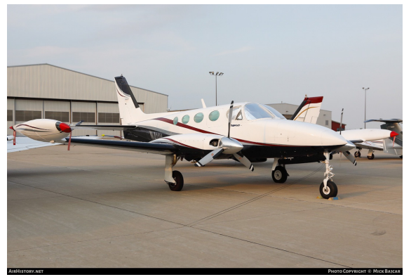
Cessna 340 Wingtip Pads