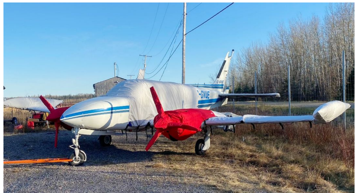
Cessna 340A Extended Canopy, Wing, Insulated Engine & Prop Covers