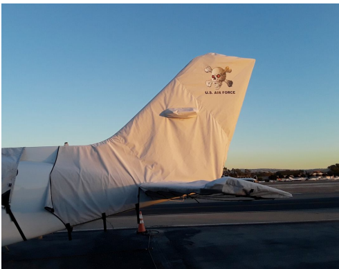
Cessna 421 Empennage Cover

WINTER USE MATERIAL - Made with Solution-Dyed Polyester fabric, this option is intended for seasonal use to aid in deicing, rain mitigation, or for occasional travel. The material is lighter and more compact, but more susceptible to UV damage and may have a shorter useful life if used continuously outside than the all-year use material.