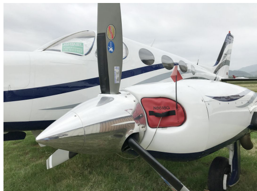
Cessna 340 Engine Inlet Plugs

Engine Inlet Plugs are custom fit for your Cessna 335, 340 intakes, made with heavy-duty vinyl material, and stuffed with a single block of sculpted urethane foam. Each plug has a zipper that allows the foam to be removed and dried if necessary. Engine plugs have warning flags that are visible from the cockpit or 'remove before flight' streamers sewn onto the face of the plugs. Most plugs are imprinted with the aircraft registration number in black for an extra charge. Storage bag NOT included. Engine plugs may be inserted after flight when the engine is still warm. Engine Inlet Plugs are commonly referred to as Cowl Plugs, Intake Plugs, Cowl Blocks, Engine Blocks, and Engine Bungs.