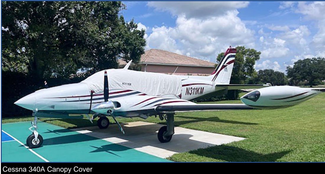
Cessna 340A Canopy Cover