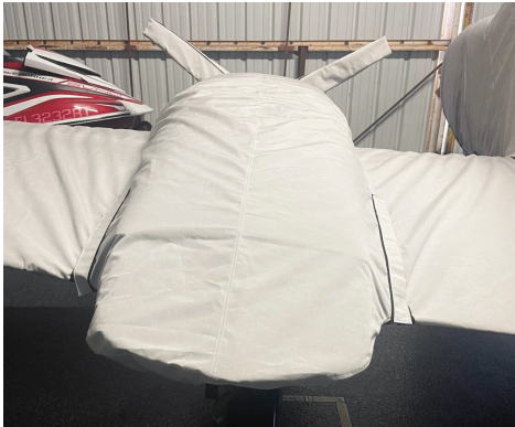
Cessna 335, 340 Empennage Cover (Tailboom, Vertical & Horiz Stabilizers), All Year Use Cessna 335, 340 Empennage Cover (Tailboom, Vertical & Horiz Stabilizers), All Year Use