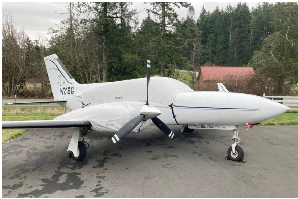
Cessna 421C Canopy & Engine Covers

This cover type is made from Silver Acrylic Sunbrella canvas and is 100% lined with a soft and smooth microfiber. Bruce's Custom Covers developed this material combination especially for aircraft protection. The outer material is medium weight and treated for water resistance, UV resistance and anti-static buildup. The inner lining is a very soft and smooth microfiber to prevent scratching. The material is very reflective, and tests show that the cabin interior temperature can be reduced to near-ambient temperature on the hottest of days. It is water, ice and snow repellent, yet breathable to allow moisture to escape from between the cover and the aircraft surface.