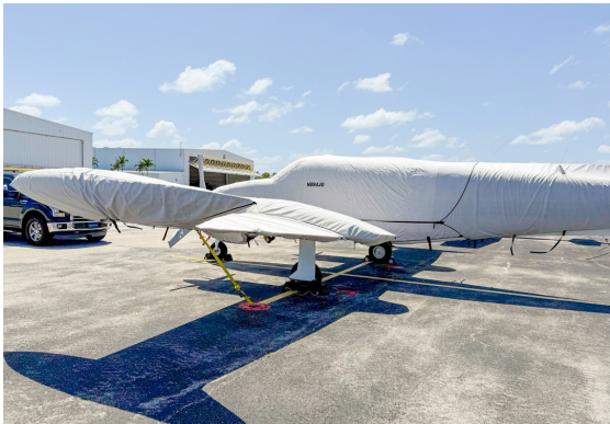
Cessna 340 Complete Cover Set