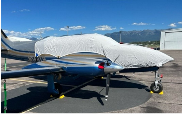
Cessna 340A Canopy/Nose Cover

This cover type is made from Silver Acrylic Sunbrella canvas and is 100% lined with a soft and smooth microfiber. Bruce's Custom Covers developed this material combination especially for aircraft protection. The outer material is medium weight and treated for water resistance, UV resistance and anti-static buildup. The inner lining is a very soft and smooth microfiber to prevent scratching. The material is very reflective, and tests show that the cabin interior temperature can be reduced to near-ambient temperature on the hottest of days. It is water, ice and snow repellent, yet breathable to allow moisture to escape from between the cover and the aircraft surface.