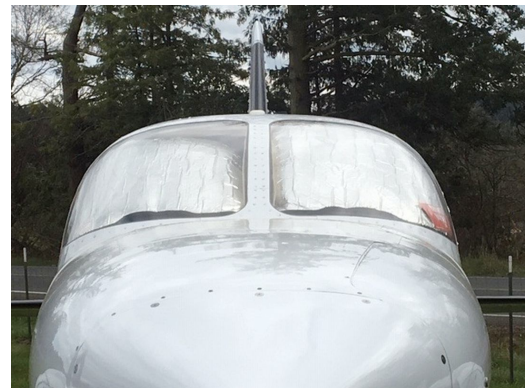
Cessna 421 Windshield HeatShields