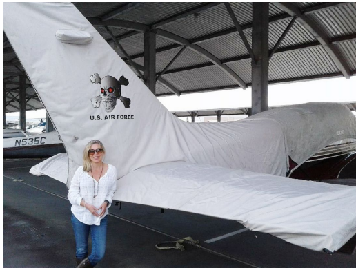
Cessna 310R Empennage Cover

shorter useful life if used continuously outside than the all-year use material.