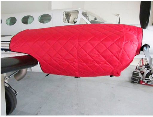
Cessna 421 Insulated Engine Covers