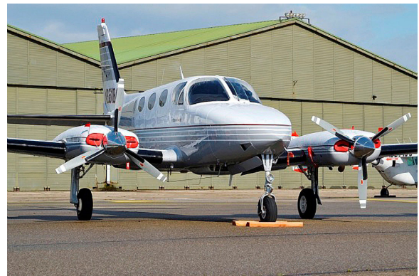
Cessna 340 Engine Plugs