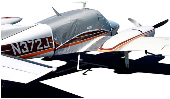
Cessna 320 Canopy Cover