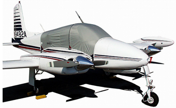
Cessna 310A Canopy Cover