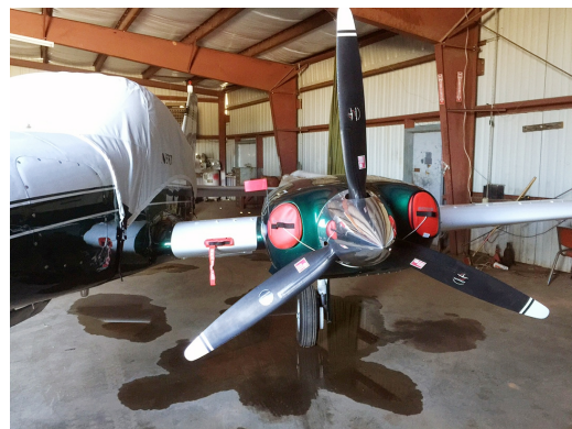
Cessna 310 Engine and Center Section Plugs