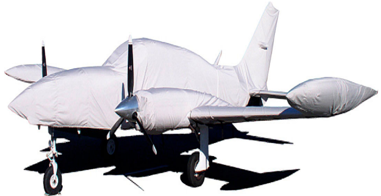
Cessna 310 Complete Cover Set