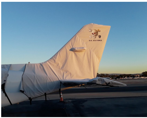
Cessna 421 Empennage Cover