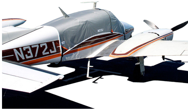
Cessna 320 Canopy Cover

Travel Covers are made with Silver Solution-Dyed Polyester fabric and only lined over the windshield to save weight. The material is lightweight and more compact for easy stowage in the aircraft. The polyester material is water resistant, but only intended for occasional use outside. We also have an ultra lightweight material available for fitted hangar dust covers. For daily outdoor use, the non-travel Sunbrella Cover is the best choice.