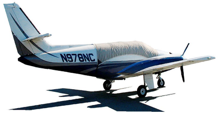
Cessna 303 Crusader Canopy Cover