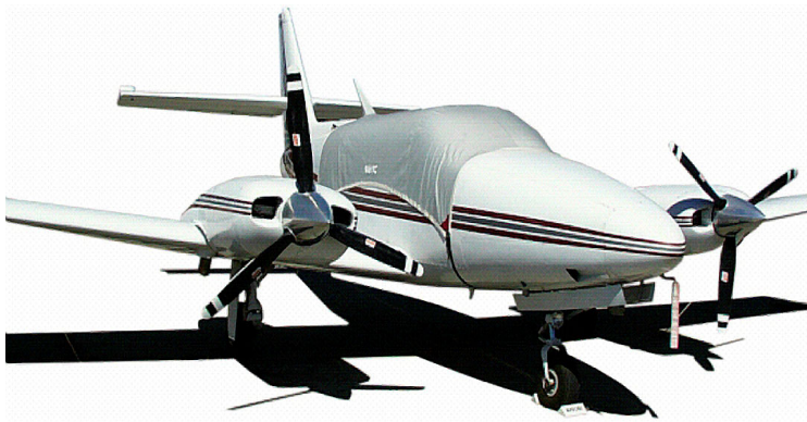
Cessna Crusader Standard Canopy Cover

This cover type is made from Silver Acrylic Sunbrella canvas and is 100% lined with a soft and smooth microfiber. Bruce's Custom Covers developed this material combination especially for aircraft protection. The outer material is medium weight and treated for water resistance, UV resistance and anti-static buildup. The inner lining is a very soft and smooth microfiber to prevent scratching. The material is very reflective, and tests show that the cabin interior temperature can be reduced to near-ambient temperature on the hottest of days. It is water, ice and snow repellent, yet breathable to allow moisture to escape from between the cover and the aircraft surface.