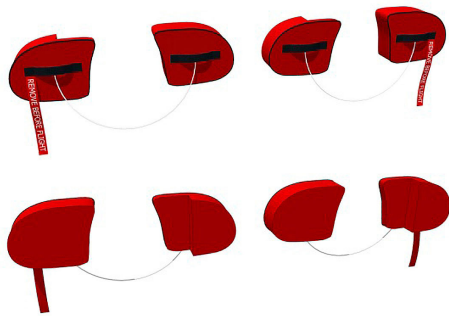
Cessna 414A Engine Plugs

Engine Inlet Plugs are custom fit for your Cessna T303 Crusader intakes, made with heavy-duty vinyl material, and stuffed with a single block of sculpted urethane foam. Each plug has a zipper that allows the foam to be removed and dried if necessary. Engine plugs have warning flags that are visible from the cockpit or 'remove before flight' streamers sewn onto the face of the plugs. Most plugs are imprinted with the aircraft registration number in black for an extra charge. Storage bag NOT included. Engine plugs may be inserted after flight when the engine is still warm. Engine Inlet Plugs are commonly referred to as Cowl Plugs, Intake Plugs, Cowl Blocks, Engine Blocks, and Engine Bungs.