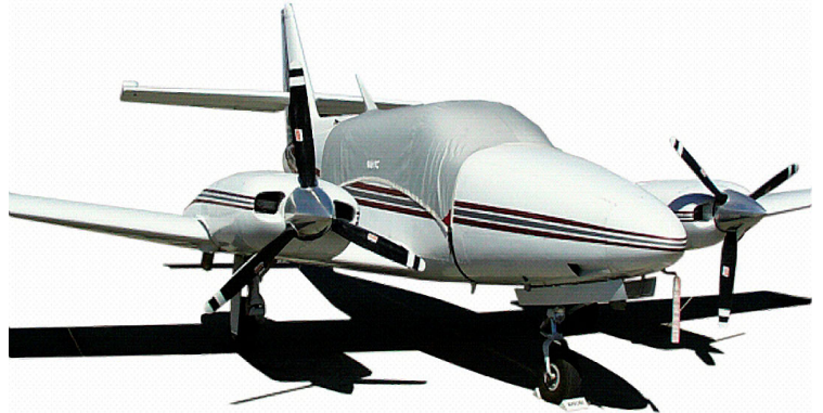
Cessna Crusader Standard Canopy Cover