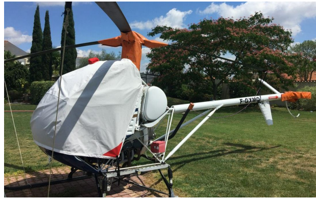
Hughes/Schweizer 300C Bubble Cover & Rotor Hub Cover