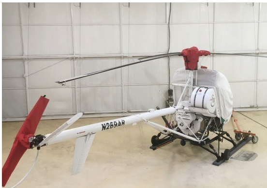
Schweizer 269C Tail Rotor cover

WINTER USE MATERIAL - Made with Solution-Dyed Polyester fabric, this option is intended for seasonal use to aid in deicing, rain mitigation, or for occasional travel. The material is lighter and more compact, but more susceptible to UV damage and may have a shorter useful life if used continuously outside than the all-year use material.