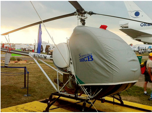
Schweizer 300CB Bubble Cover