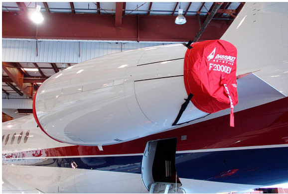
Intake Covers, OEM type (p/n 2KEX-101)

The Falcon Jet 2000EX, 2000LXS Intake Covers are designed to install easily yet be completely storable. A spring steel hoop is sewn into the hem of each cover, allowing them to be installed without climbing onto the wing or using a stepladder. To store the covers the spring steel hoop folds like a band-saw blade into three nesting rings. Each cover folds into a compact circular bundle which is stored in the included duffel bag, yet they unfold quickly for use. The Tri-Fold Ring cover is made of medium weight nylon which is available in a variety of colors to match the paint trim. Each cover set comes complete with installation and folding instructions. The aircraft's registration number can be silkscreened onto the cover for an extra charge.