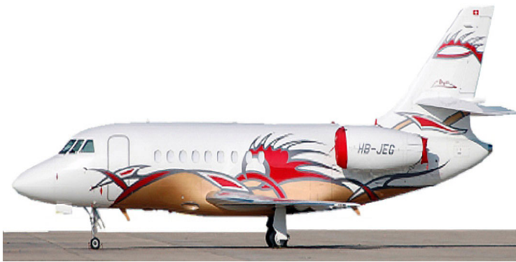
Falcon 2000EX Engine Cover Set, OEM Design

The Falcon Jet 2000EX, 2000LXS Intake Covers are designed to install easily yet be completely storable. A spring steel hoop is sewn into the hem of each cover, allowing them to be installed without climbing onto the wing or using a stepladder. To store the covers the spring steel hoop folds like a band-saw blade into three nesting rings. Each cover folds into a compact circular bundle which is stored in the included duffle bag, yet they unfold quickly for use. The Tri-Fold Ring cover is made of medium weight nylon which is available in a variety of colors to match the paint trim. Each cover set comes complete with installation and folding instructions. The aircraft's registration number can be silkscreened onto the cover for an extra charge.