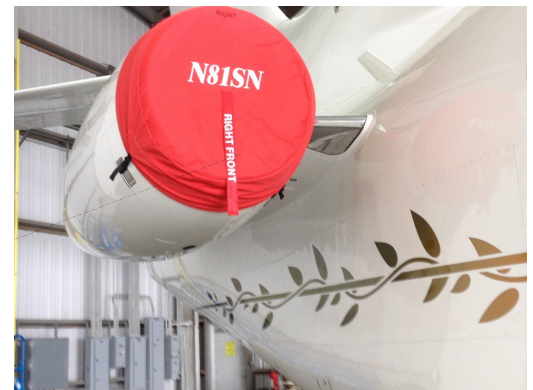
Falcon 900EX Intake Cover