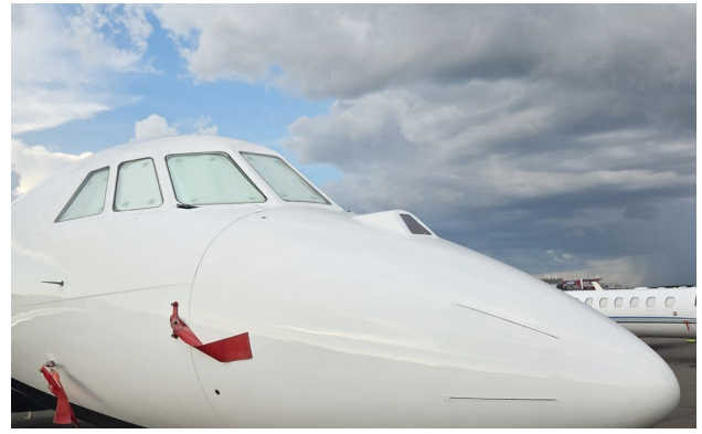
Dassault Aviation FALCON 2000EX Cockpit Heatshields (set of 7)