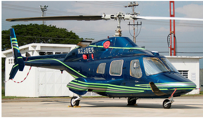
Bell 230 Engine Plugs, HeatShields