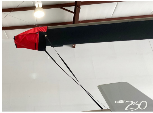
Bell 230 Blade Tie-Downs, (Semi-Rigid) W/Telescoping Attachment Handle