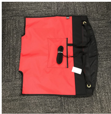
Bell 230 Blade Tie-Downs, (Semi-Rigid) W/Telescoping Attachment Handle