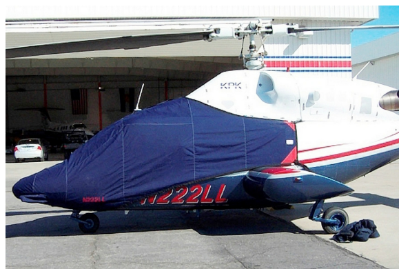
Bell 222 Bubble Cover