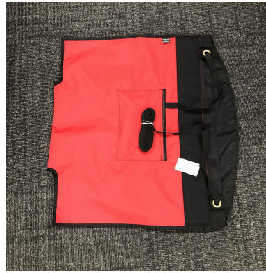
Bell 230 Blade Tie-Downs, (Semi-Rigid) W/Telescoping Attachment Handle