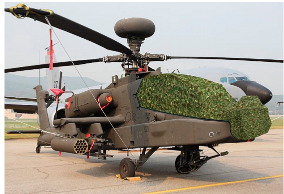
Canopy/Nose Cover, covers canopy glass and TADS