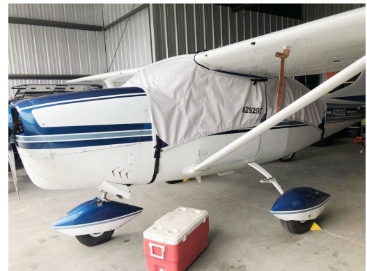
Cessna 206 Wrap-Around Canopy Cover