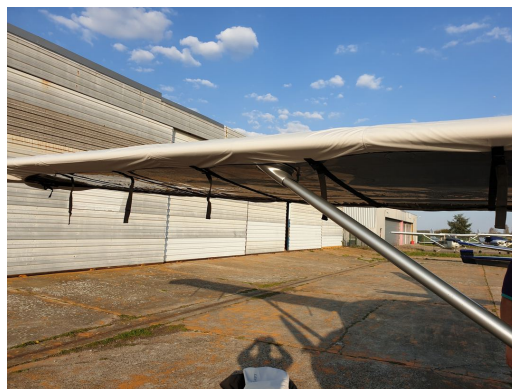
Cessna 207 Wing Covers