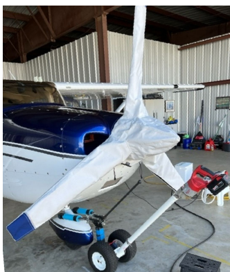
Cessna 182 Skylane 3-Blade Prop Cover

This cover type is made from Silver Acrylic Sunbrella canvas and is 100% lined with a soft and smooth microfiber. Bruce's Custom Covers developed this material combination especially for aircraft protection. The outer material is medium weight and treated for water resistance, UV resistance and anti-static buildup. The inner lining is a very soft and smooth microfiber to prevent scratching. The material is very reflective, and tests show that the cabin interior temperature can be reduced to near-ambient temperature on the hottest of days. It is water, ice and snow repellent, yet breathable to allow moisture to escape from between the cover and the aircraft surface.