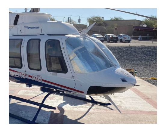
Bell 407 Windshield HeatShields