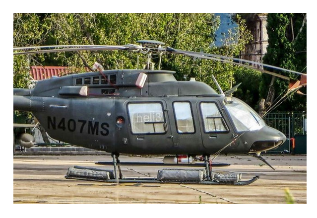
Bell 407 Cockpit & Cabin HeatShields

Heatshields are interior sunshades for an aircraft's windows or canopy glass. The product is a unique composite of closed-cell foam with a silver mylar finish. The semi-rigid design is stiff enough to stand along the inside of the windshield using sun visors or window framing. It folds up flat and easily stores in the included storage sleeve. Some designs may require velcro and suction cups. A Heatshield is an excellent short-term remedy for cockpit overheating.