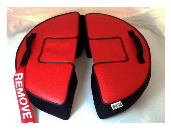
Bell 206 Swash Plate Plug