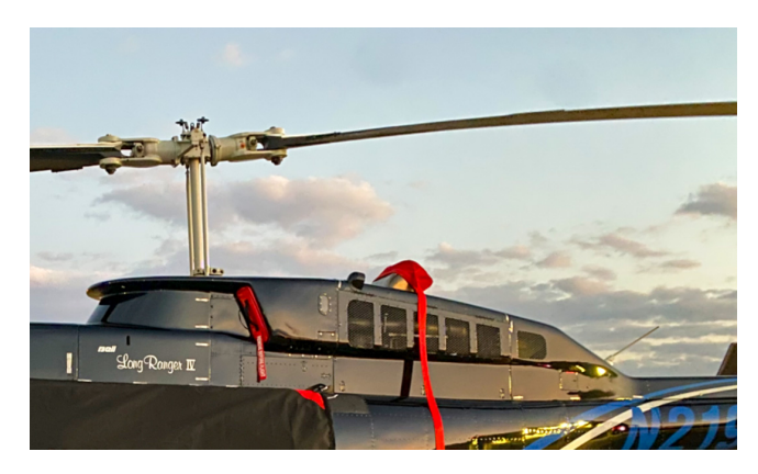
Bell 206L Longranger Exhaust Cover

WINTER USE MATERIAL - Made with Solution-Dyed Polyester fabric, this option is intended for seasonal use to aid in deicing, rain mitigation, or for occasional travel. The material is lighter and more compact, but more susceptible to UV damage and may have a shorter useful life if used continuously outside than the all-year use material.