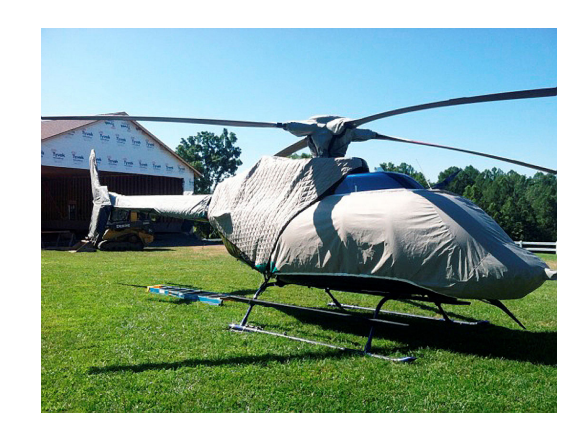
Bell 407 Covers: Bubble, Insulated Engine, Rotor Mast, Blades, Tailboom, Vertical Stabilizer and Tail Rotor