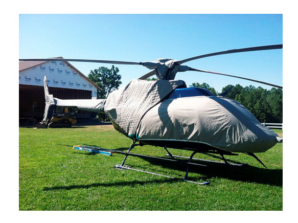
Bell 407 Covers: Bubble, Insulated Engine, Rotor Mast, Blades, Tailboom, Vertical Stabilizer and Tail Rotor

The Tailboom Cover details vary by model, but generally the helicopter tail boom cover encloses the tail boom from the "bottleneck" to the aft end. They usually also cover the horizontal stabilizers, and are custom made to allow for antennae, lights, and other protrusions. They attach with straps underneath the tail boom. Covers for the vertical and horizontal stabilizers are also available separately. Specific information for each model is available on request.