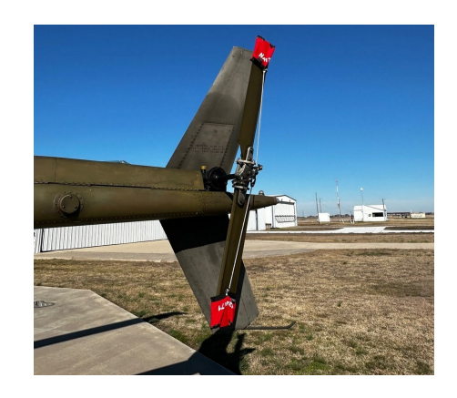
Bell 206B Jetranger Tail Rotor Tie-Downs