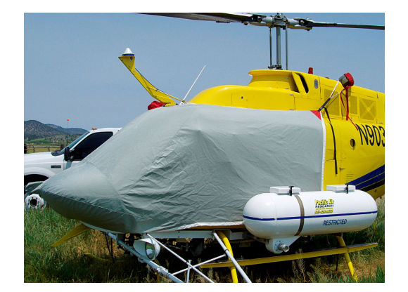
Bell 407 Covers: Bubble, Insulated Engine, Rotor Mast, Blades, Tailboom, Vertical Stabilizer and Tail Rotor