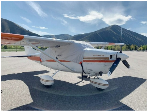
Cessna 206 Canopy Cover, Over-Top Style