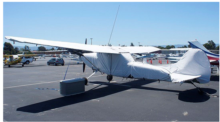
Wing Covers on Cessna Bird Dog