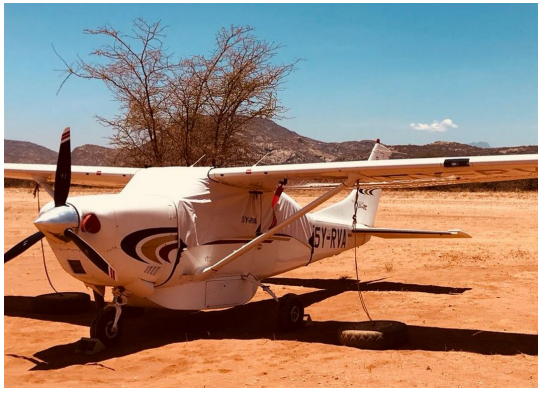
Cessna 206 Canopy Cover