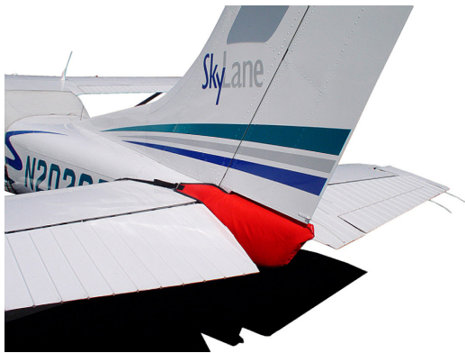
Cessna 182 Tailcone Cover

WINTER USE MATERIAL - Made with Solution-Dyed Polyester fabric, this option is intended for seasonal use to aid in deicing, rain mitigation, or for occasional travel. The material is lighter and more compact, but more susceptible to UV damage and may have a shorter useful life if used continuously outside than the all-year use material.