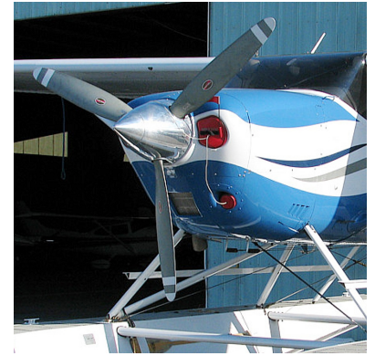
Cessna T206H Engine Inlet Plugs