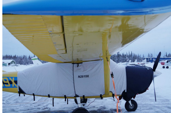
Cessna 206 Extended Canopy Cover, Insulated Engine Cover