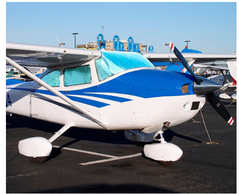
Cessna 182 HeatShield Set