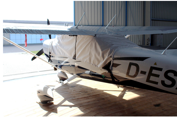
Cessna 206 Stationair Canopy Cover, Wrap-Around