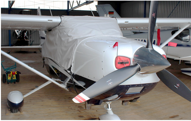
Cessna 206 Stationair Engine Inlet Plugs (206h - '98 & Up, W/Oil Cooler Inlet Plug)

be inserted after flight when the engine is still warm. Engine Inlet Plugs are commonly referred to as Cowl Plugs, Intake Plugs, Cowl Blocks, Engine Blocks, and Engine Bungs.