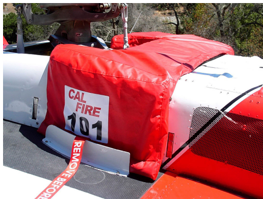
Bell 204 Intake Cover

WINTER USE MATERIAL - Made with Solution-Dyed Polyester fabric, this option is intended for seasonal use to aid in deicing, rain mitigation, or for occasional travel. The material is lighter and more compact, but more susceptible to UV damage and may have a shorter useful life if used continuously outside than the all-year use material.