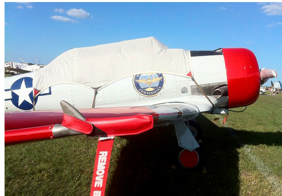
T6 Pitot, Canopy & Prop Covers