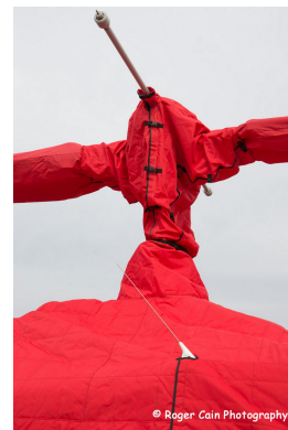
Bell 205 Engine, Rotor Mast & Blades Covers