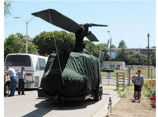
Bell 204/205 Full Body Cover Set