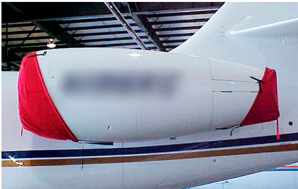
Falcon 2000 Intake/Exhaust Cover Set