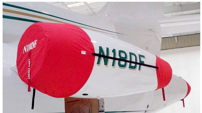
Falcon 900 Engine Cover Set