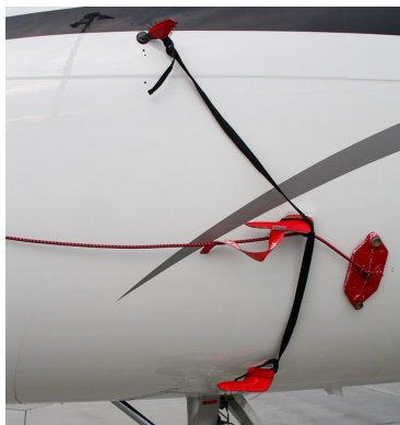
Falcon Jet 2000 Pitot Covers, Aoa's, Tat Cover Set, Heat Resistant Type