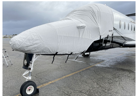
Raytheon/Beech 1900D Cockpit/Nose Cover