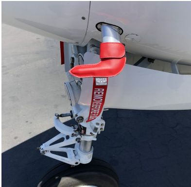
Beech King Air Pitot Covers

Engine Inlet Plugs are custom fit for your Beech 1900D intakes, made with heavy-duty vinyl material, and stuffed with a single block of sculpted urethane foam. Each plug has a zipper that allows the foam to be removed and dried if necessary. Engine plugs have warning flags that are visible from the cockpit or 'remove before flight' streamers sewn onto the face of the plugs. Most plugs are imprinted with the aircraft registration number in black for an extra charge. Storage bag NOT included. Engine plugs may be inserted after flight when the engine is still warm. Engine Inlet Plugs are commonly referred to as Cowl Plugs, Intake Plugs, Cowl Blocks, Engine Blocks, and Engine Bungs.