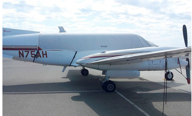
King Air 350 Canopy Cover