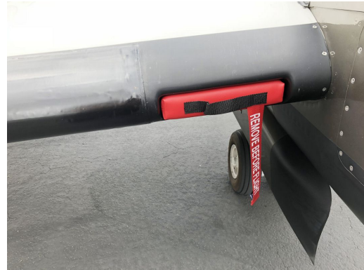
Beech King Air Heat Exchanger Inlet Plug