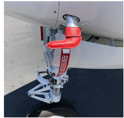
Beech King Air Pitot Covers