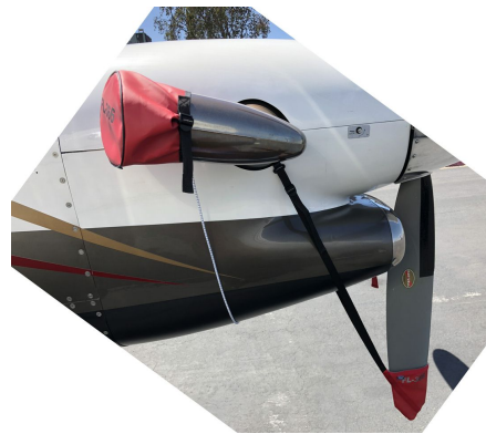
Beech King Air 350 Prop Tie-Downs/Exhaust Covers Combination