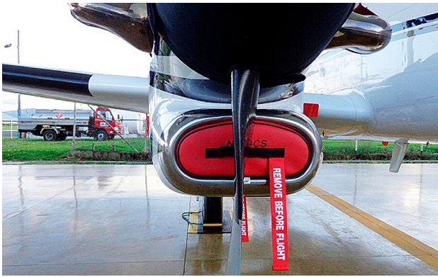
Beech King Air C90B Main Engine Inlet Plug

Engine Inlet Plugs are custom fit for your Beech 1900D intakes, made with heavy-duty vinyl material, and stuffed with a single block of sculpted urethane foam. Each plug has a zipper that allows the foam to be removed and dried if necessary. Engine plugs have warning flags that are visible from the cockpit or 'remove before flight' streamers sewn onto the face of the plugs. Most plugs are imprinted with the aircraft registration number in black for an extra charge. Storage bag NOT included. Engine plugs may be inserted after flight when the engine is still warm. Engine Inlet Plugs are commonly referred to as Cowl Plugs, Intake Plugs, Cowl Blocks, Engine Blocks, and Engine Bungs.