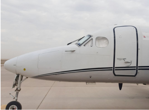
Raytheon 1900D Cockpit HeatShields

Cockpit Heatshields are interior sunshades for the aircraft's cockpit. The product is a unique composite of closed-cell foam with a silver mylar finish. The semi-rigid design is stiff enough to stand inside the window framing. The set folds up flat and is easily stored in the included storage sleeve. Some designs may require velcro and suction cups. A Heatshield is an excellent short-term remedy for cockpit overheating, but an external fabric cover is more effective for long-term protection.