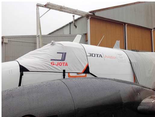
King Air Windshield/Cockpit Cover

The Beech 1900D Nose Cover is designed to cover the section of the fuselage forward of the windshield to the tip of the nose. It is secured with belly straps. This cover type is made from Silver Acrylic Sunbrella canvas and is 100% lined with a soft and smooth microfiber. Bruce's Custom Covers developed this material combination especially for aircraft protection. The outer material is medium weight and treated for water resistance, UV resistance and anti-static buildup. The inner lining is a very soft and smooth microfiber to prevent scratching. The material is very reflective, and tests show that the cabin interior temperature can be reduced to near-ambient temperature on the hottest of days. It is water, ice and snow repellent, yet breathable to allow moisture to escape from between the cover and the aircraft surface.