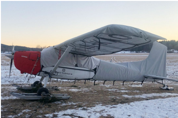
Cessna A185E Winter Cover Set