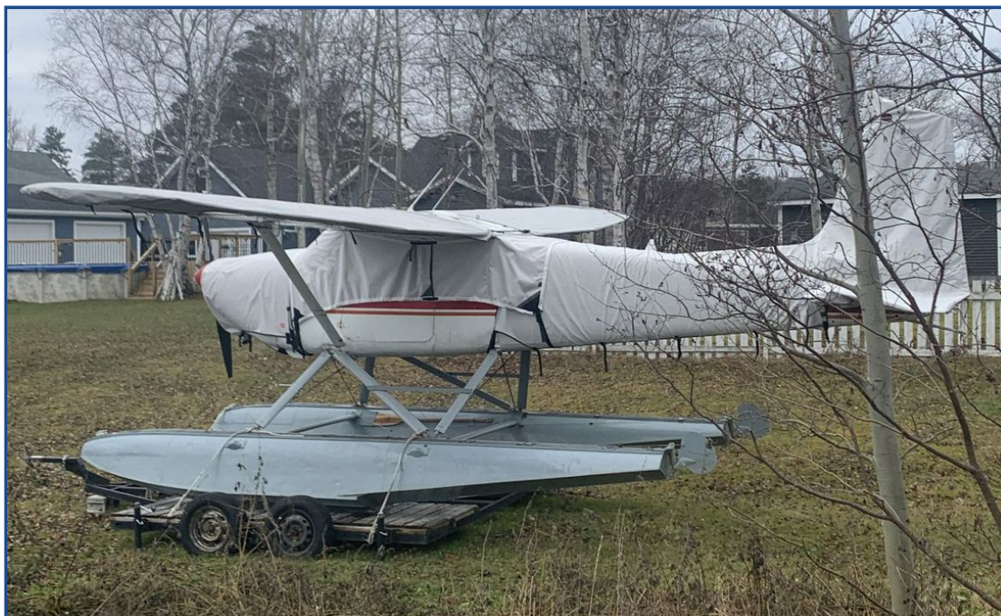
Cessna 180A Canopy, Engine, Wing &amp; Empennage Covers