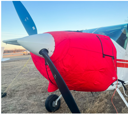
Cessna 180/185 Skywagon Insulated Engine Cover, Fully Enclosed