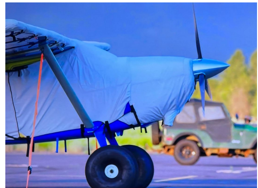
Cessna 185 Canopy, Wing & Engine Covers