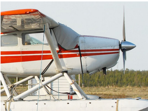
Cessna A185E Windshield Cover

This cover type is made from Silver Acrylic Sunbrella canvas and is 100% lined with a soft and smooth microfiber. Bruce's Custom Covers developed this material combination especially for aircraft protection. The outer material is medium weight and treated for water resistance, UV resistance and anti-static buildup. The inner lining is a very soft and smooth microfiber to prevent scratching. The material is very reflective, and tests show that the cabin interior temperature can be reduced to near-ambient temperature on the hottest of days. It is water, ice and snow repellent, yet breathable to allow moisture to escape from between the cover and the aircraft surface.