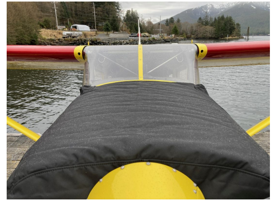
Cessna 180H Insulated Engine Cover