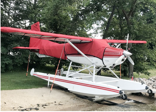
Cessna 185 Canopy, Wings & Empennage Covers, and Engine Plugs

The material is very reflective, and tests show that the cabin interior temperature can be reduced to near-ambient temperature on the hottest of days. It is water, ice and snow repellent, yet breathable to allow moisture to escape from between the cover and the aircraft surface.