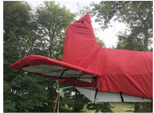
Cessna 185 Empennage Cover