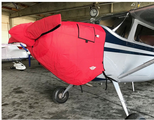
Cessna 180/185 Insulated Engine & Prop Cover