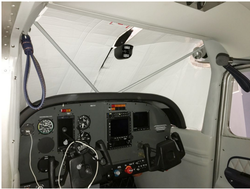
Cessna 180 Skywagon Windshield Heatshield, (W/ Compass)

Windshield Heatshields are interior sunshades for an aircraft's front windshield. The product is a unique composite of closed-cell foam with a silver mylar finish. The semi-rigid design is stiff enough to stand along the inside of the windshield using sun visors or window framing. It folds up flat and easily stores in the included storage sleeve. Some designs may require velcro and suction cups or split right and left sides. A Heatshield is an excellent short-term remedy for cockpit overheating. An external fabric cover is far more effective and practical for long-term protection.