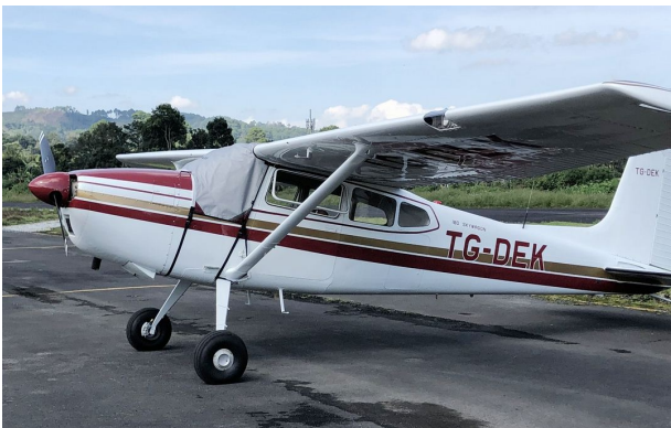
Cessna 180 Windshield Cover

This cover type is made from Silver Acrylic Sunbrella canvas and is 100% lined with a soft and smooth microfiber. Bruce's Custom Covers developed this material combination especially for aircraft protection. The outer material is medium weight and treated for water resistance, UV resistance and anti-static buildup. The inner lining is a very soft and smooth microfiber to prevent scratching. The material is very reflective, and tests show that the cabin interior temperature can be reduced to near-ambient temperature on the hottest of days. It is water, ice and snow repellent, yet breathable to allow moisture to escape from between the cover and the aircraft surface.