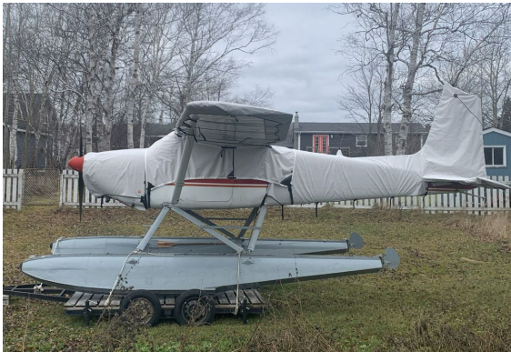
Cessna 180A Canopy, Engine, Wing & Empennage Covers

WINTER USE MATERIAL - Made with Solution-Dyed Polyester fabric, this option is intended for seasonal use to aid in deicing, rain mitigation, or for occasional travel. The material is lighter and more compact, but more susceptible to UV damage and may have a shorter useful life if used continuously outside than the all-year use material.