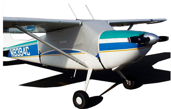
Cessna 180 Canopy Cover