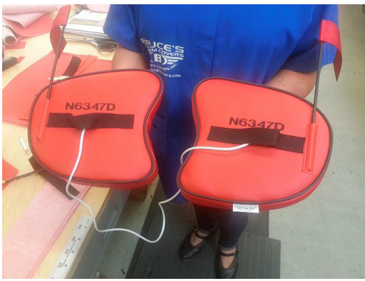
Cessna 172 Standard Engine Plugs