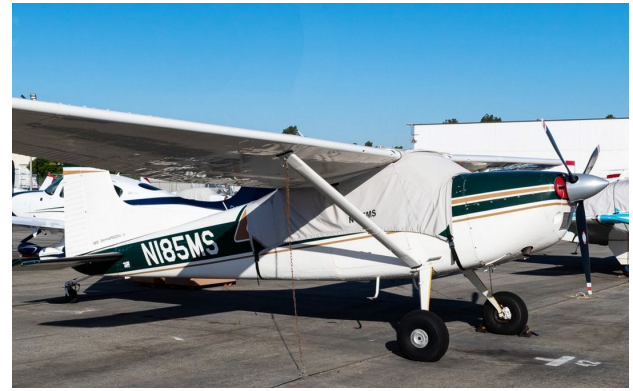
Cessna A185F Canopy Cover, Engine Plugs