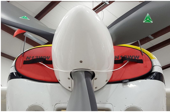
Cessna 185F Engine Plugs