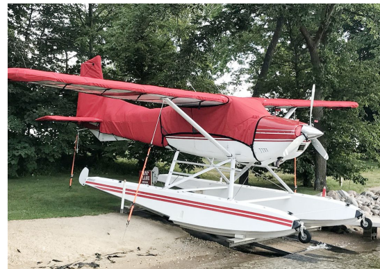
Cessna 185 Canopy, Wings & Empennage Covers, and Engine Plugs