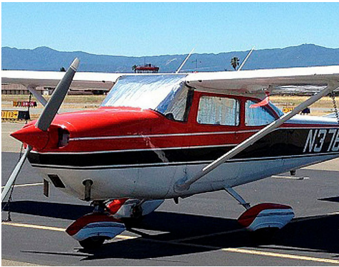
Cessna 172 Cabin HeatShields