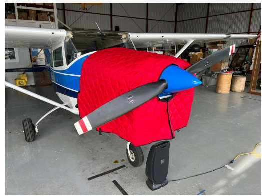
Insulated Hangar Blanket on Cessna 182