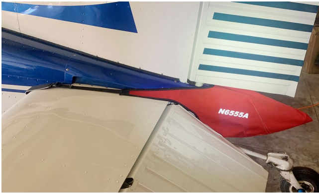
Cessna 180 Skywagon Tailcone Cover

WINTER USE MATERIAL - Made with Solution-Dyed Polyester fabric, this option is intended for seasonal use to aid in deicing, rain mitigation, or for occasional travel. The material is lighter and more compact, but more susceptible to UV damage and may have a shorter useful life if used continuously outside than the all-year use material.