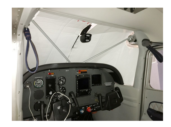
Cessna 180 Skywagon Windshield Heatshield, (W/ Compass)