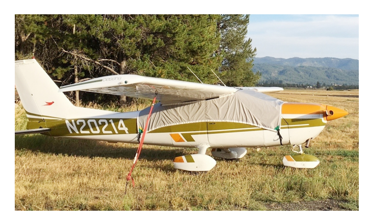
Cessna 177 Cardinal Travel Cover, Light Weight Travel Canopy Cover (Wrap Around), 6 Lbs

Travel Covers are made with Silver Solution-Dyed Polyester fabric and only lined over the windshield to save weight. The material is lightweight and more compact for easy stowage in the aircraft. The polyester material is water resistant, but only intended for occasional use outside. We also have an ultra lightweight material available for fitted hangar dust covers. For daily outdoor use, the non-travel Sunbrella Cover is the best choice.