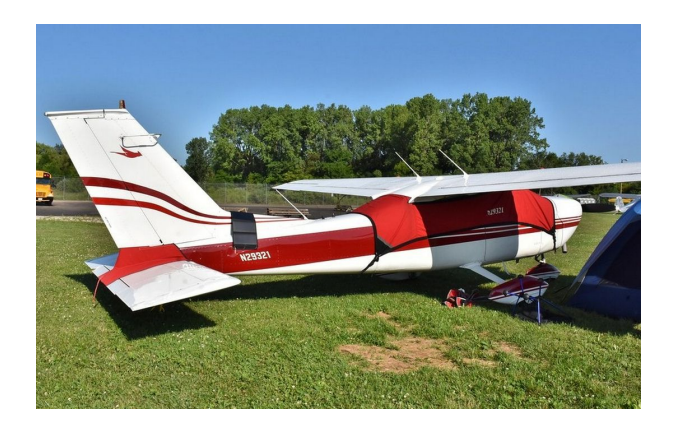
Cessna Cardinal Canopy Cover, Tailcone Cover

This cover type is made from Silver Acrylic Sunbrella canvas and is 100% lined with a soft and smooth microfiber. Bruce's Custom Covers developed this material combination especially for aircraft protection. The outer material is medium weight and treated for water resistance, UV resistance and anti-static buildup. The inner lining is a very soft and smooth microfiber to prevent scratching. The material is very reflective, and tests show that the cabin interior temperature can be reduced to near-ambient temperature on the hottest of days. It is water, ice and snow repellent, yet breathable to allow moisture to escape from between the cover and the aircraft surface.