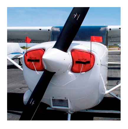
Cessna 172 Engine Plugs