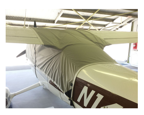
Cessna 177 Cardinal Travel Cover, Light Weight Travel Canopy Cover (Over-The-Top Style), 7 Lbs