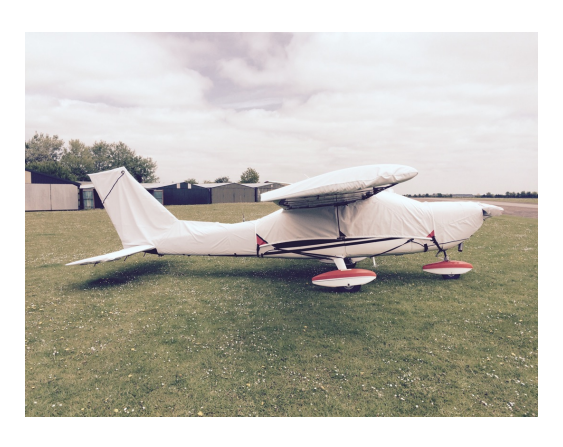
Cessna Cardinal Full Cover Set