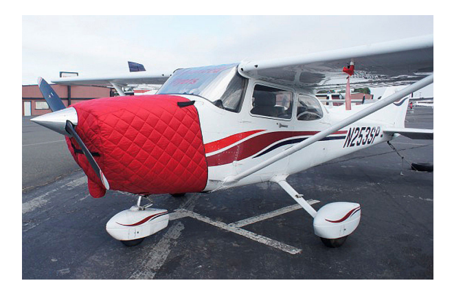
Cessna 172 Insulated Engine Cover, fully enclosed

This cover type is made from Silver Acrylic Sunbrella canvas and is 100% lined with a soft and smooth microfiber. Bruce's Custom Covers developed this material combination especially for aircraft protection. The outer material is medium weight and treated for water resistance, UV resistance and anti-static buildup. The inner lining is a very soft and smooth microfiber to prevent scratching. The material is very reflective, and tests show that the cabin interior temperature can be reduced to near-ambient temperature on the hottest of days. It is water, ice and snow repellent, yet breathable to allow moisture to escape from between the cover and the aircraft surface.