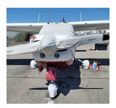
Cessna 177RG Tire & Prop Covers

ALL-YEAR USE MATERIAL - Made with Silver Acrylic Sunbrella canvas, the all-year use material is the best option for sun protection and cover longevity. This heavier more durable material is intended for all weather conditions, such as rain and snow or lots of sun.