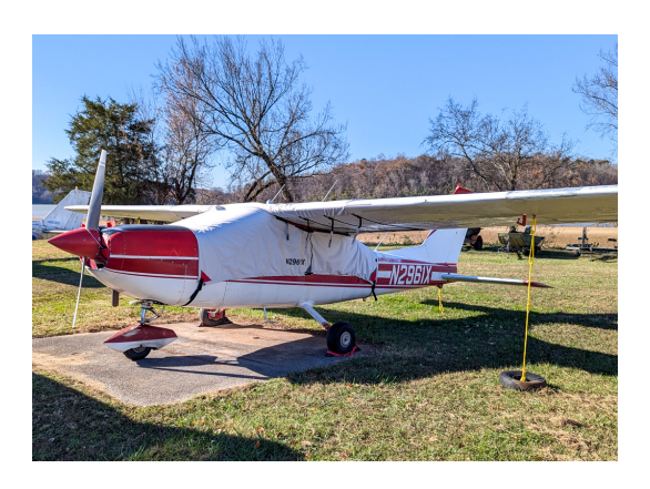
Cessna 177 Cardinal Canopy Cover, Over-Top Style, Belly Strap Type, Extends Out Past Gas Caps