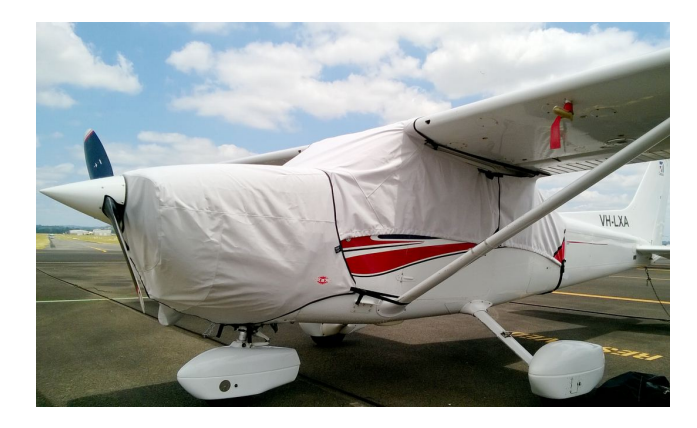
Cessna 172 Canopy & Engine Covers