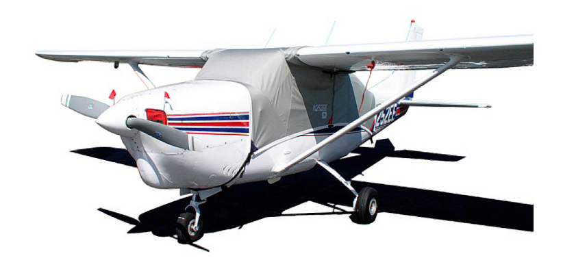
Cessna 210 Over-Top Canopy Cover

Engine Inlet Plugs are custom fit for your Cessna 177 Cardinal intakes, made with heavy-duty vinyl material, and stuffed with a single block of sculpted urethane foam. Each plug has a zipper that allows the foam to be removed and dried if necessary. Engine plugs have warning flags that are visible from the cockpit or 'remove before flight' streamers sewn onto the face of the plugs. Most plugs are imprinted with the aircraft registration number in black for an extra charge. Storage bag NOT included. Engine plugs may be inserted after flight when the engine is still warm. Engine Inlet Plugs are commonly referred to as Cowl Plugs, Intake Plugs, Cowl Blocks, Engine Blocks, and Engine Bungs.