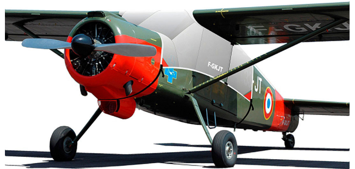
Broussard Canopy Cover (illustration)