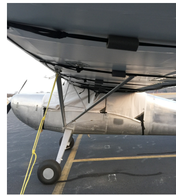
Cessna 140 Canopy Cover, Wing Covers