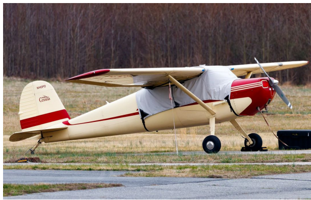
Cessna 140 Canopy Cover