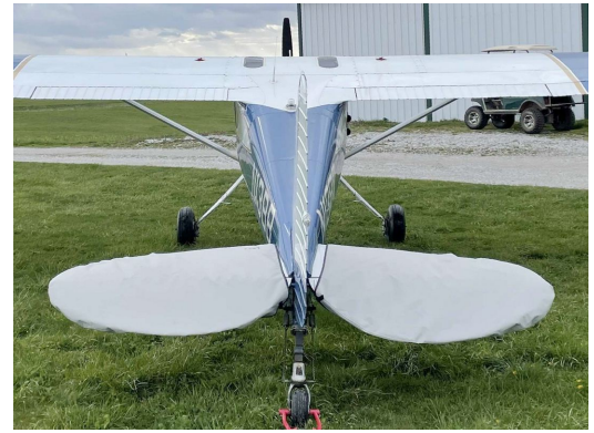
Cessna 140 Horizontal Stabilizer Covers