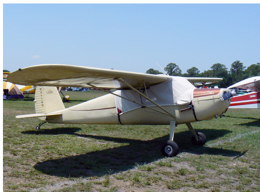
Cessna 140 Over-Top Canopy Cover

This cover type is made from Silver Acrylic Sunbrella canvas and is 100% lined with a soft and smooth microfiber. Bruce's Custom Covers developed this material combination especially for aircraft protection. The outer material is medium weight and treated for water resistance, UV resistance and anti-static buildup. The inner lining is a very soft and smooth microfiber to prevent scratching. The material is very reflective, and tests show that the cabin interior temperature can be reduced to near-ambient temperature on the hottest of days. It is water, ice and snow repellent, yet breathable to allow moisture to escape from between the cover and the aircraft surface.