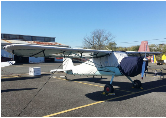
Cessna 140 Canopy, Engine, Wing & Empennage Covers