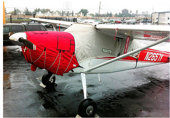
Cessna 180 Insulated Engine Cover