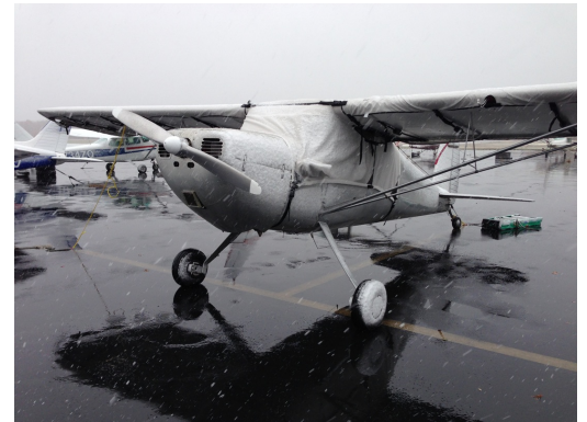
Cessna 120/140 Canopy and Wing Covers