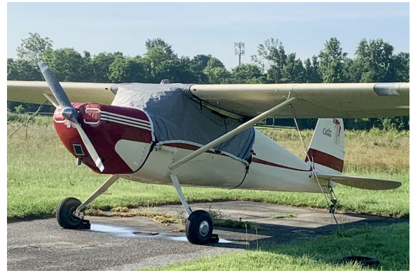
Cessna 140 Travel Weight Canopy Cover