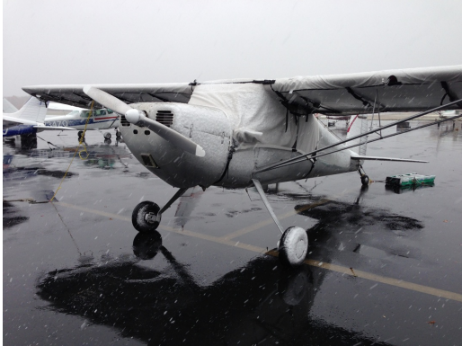
Cessna 120/140 Canopy and Wing Covers

WINTER USE MATERIAL - Made with Solution-Dyed Polyester fabric, this option is intended for seasonal use to aid in deicing, rain mitigation, or for occasional travel. The material is lighter and more compact, but more susceptible to UV damage and may have a shorter useful life if used continuously outside than the all-year use material.