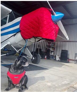
Piper PA-12 Insulated Hangar Blanket

This cover type is made from Silver Acrylic Sunbrella canvas and is 100% lined with a soft and smooth microfiber. Bruce's Custom Covers developed this material combination especially for aircraft protection. The outer material is medium weight and treated for water resistance, UV resistance and anti-static buildup. The inner lining is a very soft and smooth microfiber to prevent scratching. The material is very reflective, and tests show that the cabin interior temperature can be reduced to near-ambient temperature on the hottest of days. It is water, ice and snow repellent, yet breathable to allow moisture to escape from between the cover and the aircraft surface.