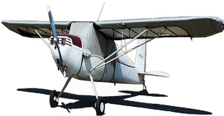
Cessna 120 Canopy Cover & Wing Covers

This cover type is made from Silver Acrylic Sunbrella canvas and is 100% lined with a soft and smooth microfiber. Bruce's Custom Covers developed this material combination especially for aircraft protection. The outer material is medium weight and treated for water resistance, UV resistance and anti-static buildup. The inner lining is a very soft and smooth microfiber to prevent scratching. The material is very reflective, and tests show that the cabin interior temperature can be reduced to near-ambient temperature on the hottest of days. It is water, ice and snow repellent, yet breathable to allow moisture to escape from between the cover and the aircraft surface.