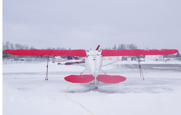
Cessna 120 Insulated Engine & Prop Covers, Wing & Tail Covers