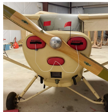
Aeronca 11AC Engine Inlet Plugs