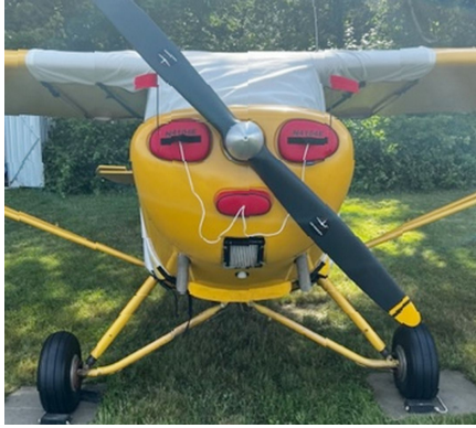
Aeronca 11CC Super Chief Engine Plugs, Extended Canopy Cover (also covers gas caps)

Engine Inlet Plugs are custom fit for your Aeronca Chief 11AC, Super Chief 11CC intakes, made with heavy-duty vinyl material, and stuffed with a single block of sculpted urethane foam. Each plug has a zipper that allows the foam to be removed and dried if necessary. Engine plugs have warning flags that are visible from the cockpit or 'remove before flight' streamers sewn onto the face of the plugs. Most plugs are imprinted with the aircraft registration number in black for an extra charge. Storage bag NOT included. Engine plugs may be inserted after flight when the engine is still warm. Engine Inlet Plugs are commonly referred to as Cowl Plugs, Intake Plugs, Cowl Blocks, Engine Blocks, and Engine Bungs.