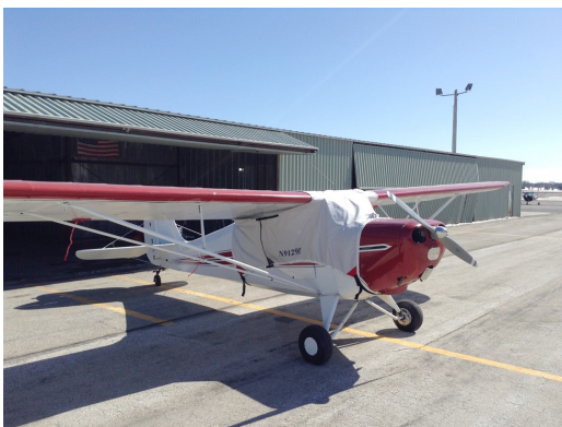
Aeronca Chief Canopy Cover

This cover type is made from Silver Acrylic Sunbrella canvas and is 100% lined with a soft and smooth microfiber. Bruce's Custom Covers developed this material combination especially for aircraft protection. The outer material is medium weight and treated for water resistance, UV resistance and anti-static buildup. The inner lining is a very soft and smooth microfiber to prevent scratching. The material is very reflective, and tests show that the cabin interior temperature can be reduced to near-ambient temperature on the hottest of days. It is water, ice and snow repellent, yet breathable to allow moisture to escape from between the cover and the aircraft surface.