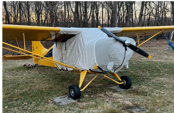
Aeronca Chief 11AC, Super Chief 11CC Insulated Engine Cover