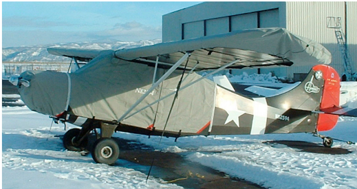
Extended Canopy Cover, Engine & Wing Covers

WINTER USE MATERIAL - Made with Solution-Dyed Polyester fabric, this option is intended for seasonal use to aid in deicing, rain mitigation, or for occasional travel. The material is lighter and more compact, but more susceptible to UV damage and may have a shorter useful life if used continuously outside than the all-year use material.