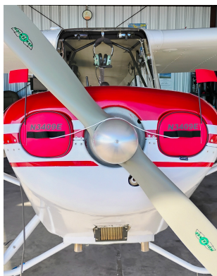
Aeronca 7AC Engine Inlet Plugs

Engine Inlet Plugs are custom fit for your Aeronca Chief 11AC, Super Chief 11CC intakes, made with heavy-duty vinyl material, and stuffed with a single block of sculpted urethane foam. Each plug has a zipper that allows the foam to be removed and dried if necessary. Engine plugs have warning flags that are visible from the cockpit or 'remove before flight' streamers sewn onto the face of the plugs. Most plugs are imprinted with the aircraft registration number in black for an extra charge. Storage bag NOT included. Engine plugs may be inserted after flight when the engine is still warm. Engine Inlet Plugs are commonly referred to as Cowl Plugs, Intake Plugs, Cowl Blocks, Engine Blocks, and Engine Bungs.