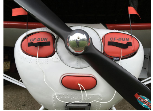
Aeronca 11AC Engine Inlet Plugs