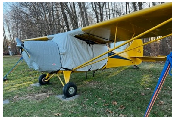
Taylorcraft Insulated Engine Cover, Prop and Canopy Covers