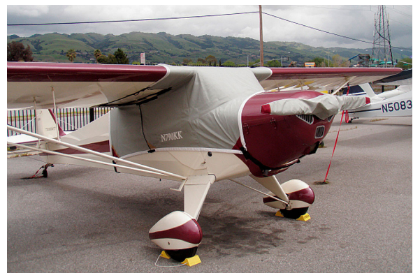
Taylorcraft Over-Top Canopy Cover