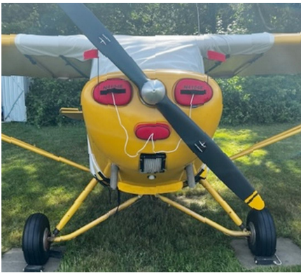
Aeronca 11CC Super Chief Engine Plugs, Extended Canopy Cover (also covers gas caps)