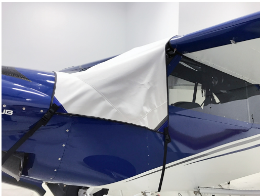
Cub Crafters CC-11 Windshield Cover

This cover type is made from Silver Acrylic Sunbrella canvas and is 100% lined with a soft and smooth microfiber. Bruce's Custom Covers developed this material combination especially for aircraft protection. The outer material is medium weight and treated for water resistance, UV resistance and anti-static buildup. The inner lining is a very soft and smooth microfiber to prevent scratching. The material is very reflective, and tests show that the cabin interior temperature can be reduced to near-ambient temperature on the hottest of days. It is water, ice and snow repellent, yet breathable to allow moisture to escape from between the cover and the aircraft surface.