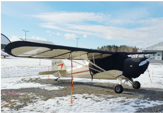
Aeronca Chief 11AC Canopy, Insulated Engine, & Wing Covers

This cover type is made from Silver Acrylic Sunbrella canvas and is 100% lined with a soft and smooth microfiber. Bruce's Custom Covers developed this material combination especially for aircraft protection. The outer material is medium weight and treated for water resistance, UV resistance and anti-static buildup. The inner lining is a very soft and smooth microfiber to prevent scratching. The material is very reflective, and tests show that the cabin interior temperature can be reduced to near-ambient temperature on the hottest of days. It is water, ice and snow repellent, yet breathable to allow moisture to escape from between the cover and the aircraft surface.