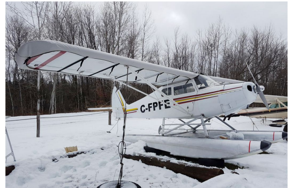
Christavia Mk 1 Wing Covers