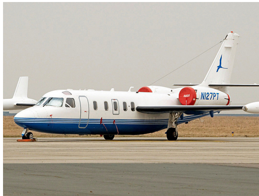
Engine Covers & Cockpit HeatShields

Cockpit Heatshields are interior sunshades for the aircraft's cockpit. The product is a unique composite of closed-cell foam with a silver mylar finish. The semi-rigid design is stiff enough to stand inside the window framing. The set folds up flat and is easily stored in the included storage sleeve. Some designs may require velcro and suction cups. Our Heatshields for jets are offered white side out because some aircraft manufacturers have issued advisories against reflective window inserts due to potential heat damage. A Heatshield is an excellent short-term remedy for cockpit overheating, but an external fabric cover is more effective for long-term protection.