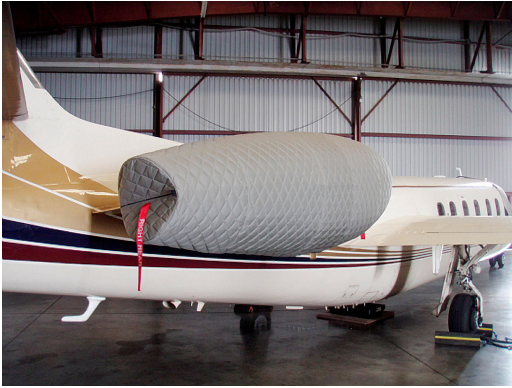
IAI Westwind 1124 Insulated Engine Nacelle Cover

instructions. The aircraft's registration number can be silkscreened onto the cover for an extra charge.