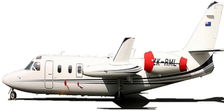
Jet Commander Engine Covers

instructions. The aircraft's registration number can be silkscreened onto the cover for an extra charge.