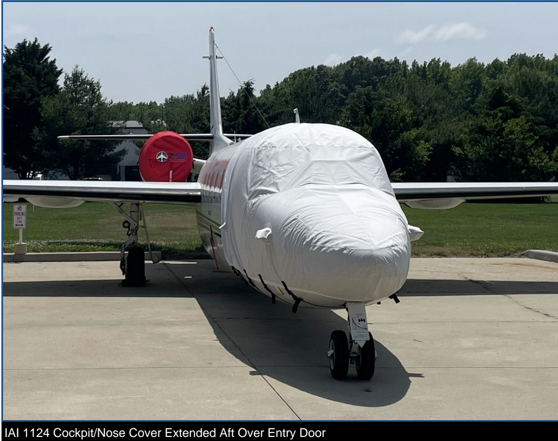
IAI 1124 Cockpit/Nose Cover Extended Aft Over Entry Door