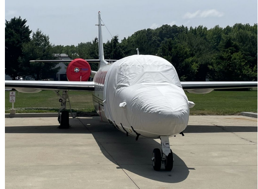
IAI 1124 Cockpit/Nose Cover Extended Aft Over Entry Door