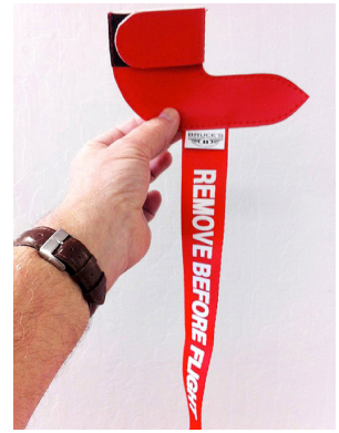
Standard Pitot Cover