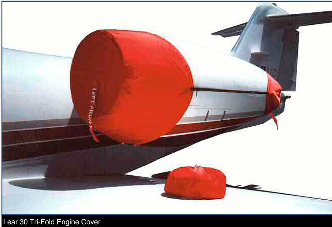
Lear 30 Tri-Fold Engine Cover