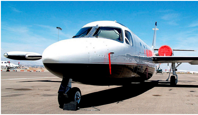
Westwind Engine Cover Set, Pitot Cover