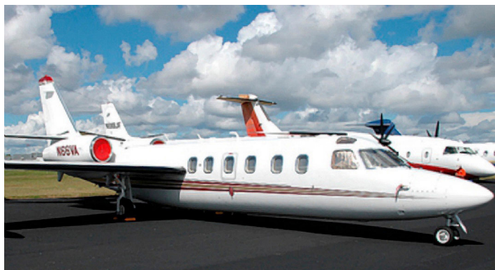
Westwind Engine Intake Plugs