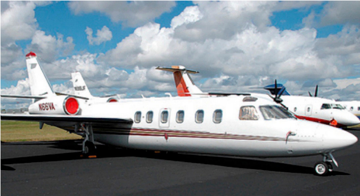
Westwind Engine Intake Plugs

The Engine Inlet Plugs are custom fit for your Israel Aircraft Industries Jet Commander 1121 intakes, made with heavy-duty vinyl material, and stuffed with a single block of sculpted urethane foam. Each plug has a zipper that allows the foam to be removed and dried if necessary. Engine plugs have 'remove before flight' streamers sewn onto the face of the plugs. Most plugs are imprinted with the aircraft registration number in black for an extra charge. Storage bag NOT included. Engine plugs may be inserted after flight when the engine is still warm. Engine Inlet Plugs are commonly referred to as Cowl Plugs, Intake Plugs, Cowl Blocks, Engine Blocks, and Engine Bungs.