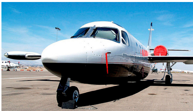
Westwind Engine Cover Set, Pitot Cover

The Engine Inlet Plugs are custom fit for your Israel Aircraft Industries Jet Commander 1121 intakes, made with heavy-duty vinyl material, and stuffed with a single block of sculpted urethane foam. Each plug has a zipper that allows the foam to be removed and dried if necessary. Engine plugs have 'remove before flight' streamers sewn onto the face of the plugs. Most plugs are imprinted with the aircraft registration number in black for an extra charge. Storage bag NOT included. Engine plugs may be inserted after flight when the engine is still warm. Engine Inlet Plugs are commonly referred to as Cowl Plugs, Intake Plugs, Cowl Blocks, Engine Blocks, and Engine Bungs.