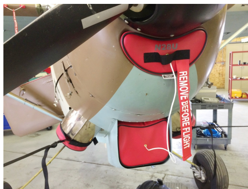
Siai Marchetti 1019 Engine Plugs, Prop Tie-Exhaust Covers