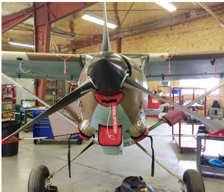
Siai Marchetti 1019 Engine Plugs, Prop Tie-Exhaust Covers