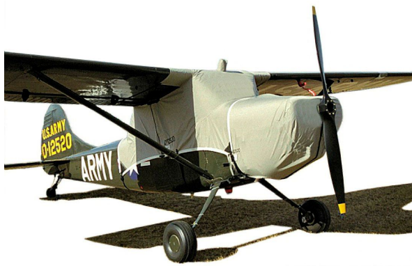
Cessna L-19 Canopy & Engine Covers (similar to Siai Marchetti 1019)

This cover type is made from Silver Acrylic Sunbrella canvas and is 100% lined with a soft and smooth microfiber. Bruce's Custom Covers developed this material combination especially for aircraft protection. The outer material is medium weight and treated for water resistance, UV resistance and anti-static buildup. The inner lining is a very soft and smooth microfiber to prevent scratching. The material is very reflective, and tests show that the cabin interior temperature can be reduced to near-ambient temperature on the hottest of days. It is water, ice and snow repellent, yet breathable to allow moisture to escape from between the cover and the aircraft surface.