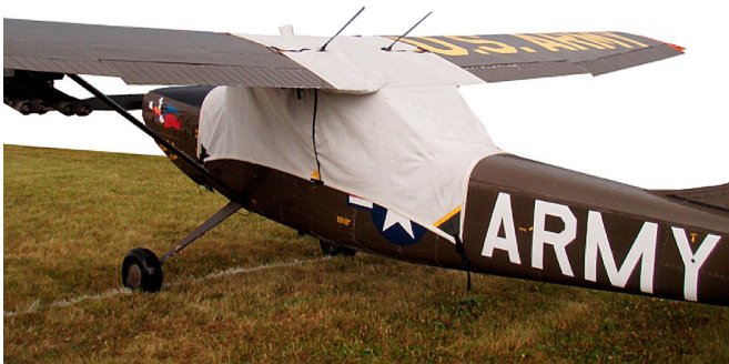
L-19 Canopy Cover (similar to Siai Marchetti 1019)