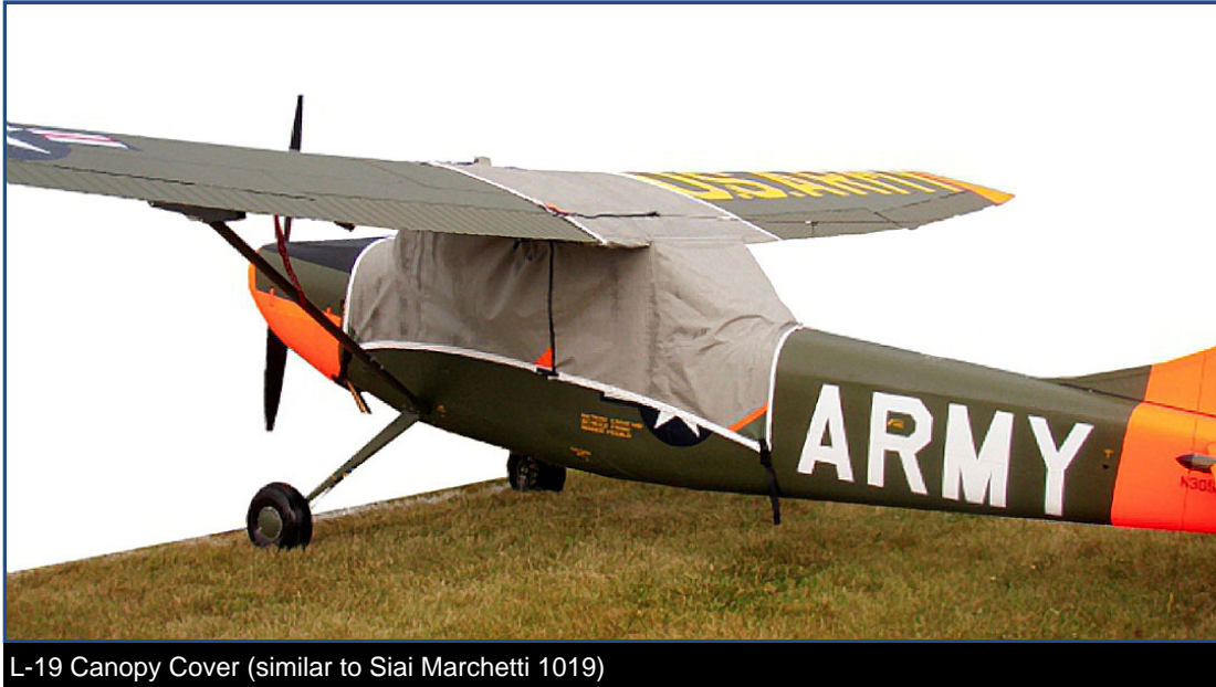
L-19 Canopy Cover (similar to Siai Marchetti 1019)