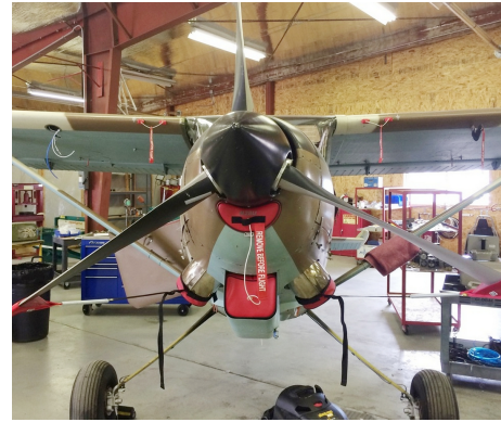
Siai Marchetti 1019 Engine Plugs, Prop Tie-Exhaust Covers